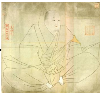
72th Emperor Shirakawa