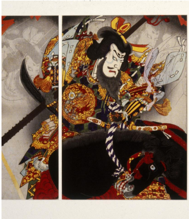
Taira no Masakado