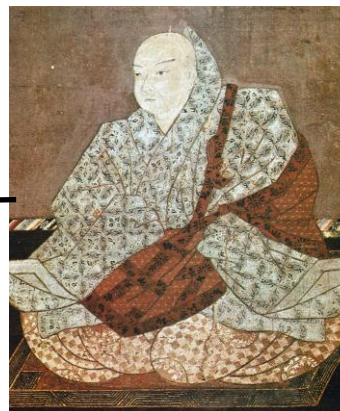
74th Emperor Toba