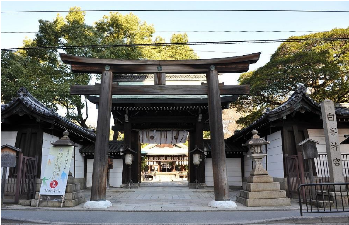
Shiramine Grand Shrine in Kyoto 白峯神宮