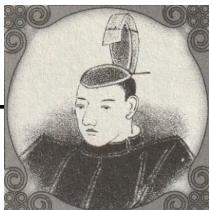
73th Emperor Horikawa