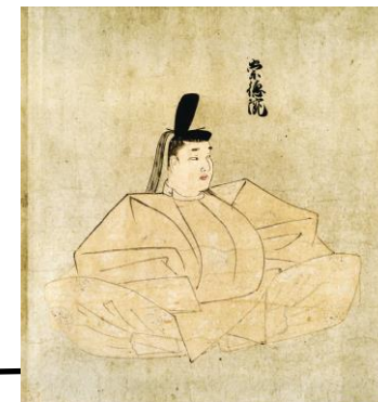
75th Emperor Sutoku