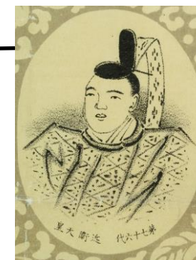
76th Emperor Konoe