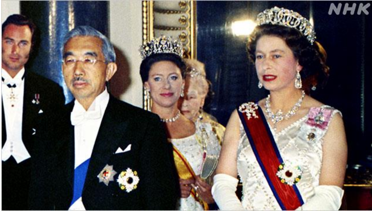
Emperor Shōwa (1901–1989) Queen Elizabeth II (1926–2022) 第126代 昭和天皇 ウィンザー朝第4代 エリザベス二世女王

"As people, we share many attributes —our technical skills, our curiosity about new knowledge, our respect for tradition, even our love for gardens and our predilection for driving on the left! But perhaps we share in particular a temperament which may be hesitant to show affection but which has a capacity for deep feeling. I hope and believe that the friendship which today binds the Japanese and British people together will endure and be strengthened."