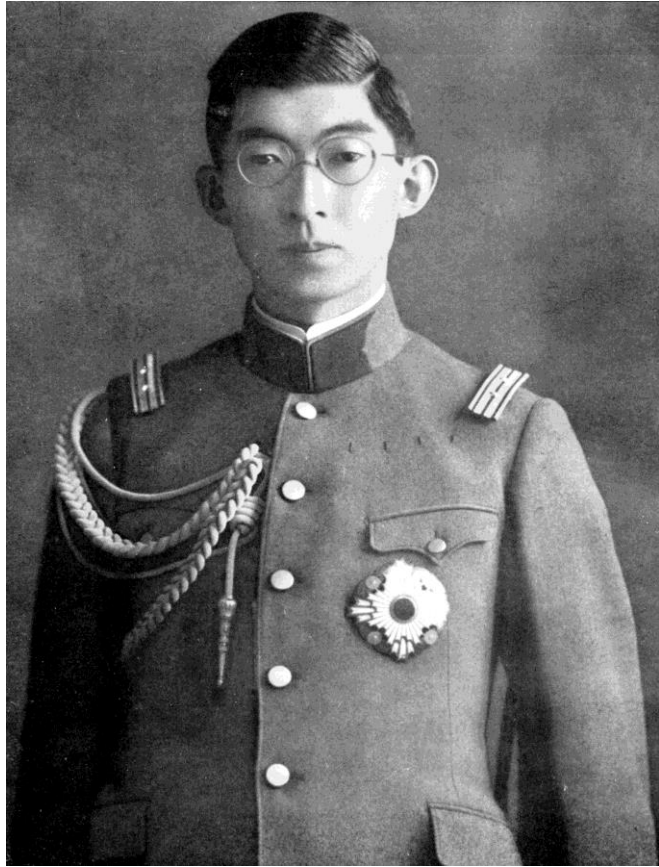
Prince Yasuhito of Chichibu 秩父宮雍仁親王 (1902-1953)