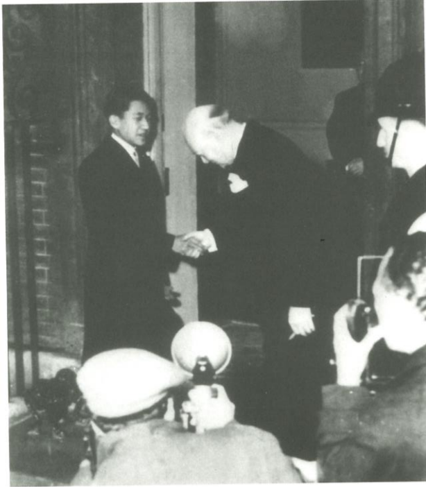
Emperor Emeritus, then Crown Prince Akihito 上皇陛下、当時皇太子明仁親王 (1933-) Sir Winston Churchill ウィンストン・チャーチル首相 (1974-1965)