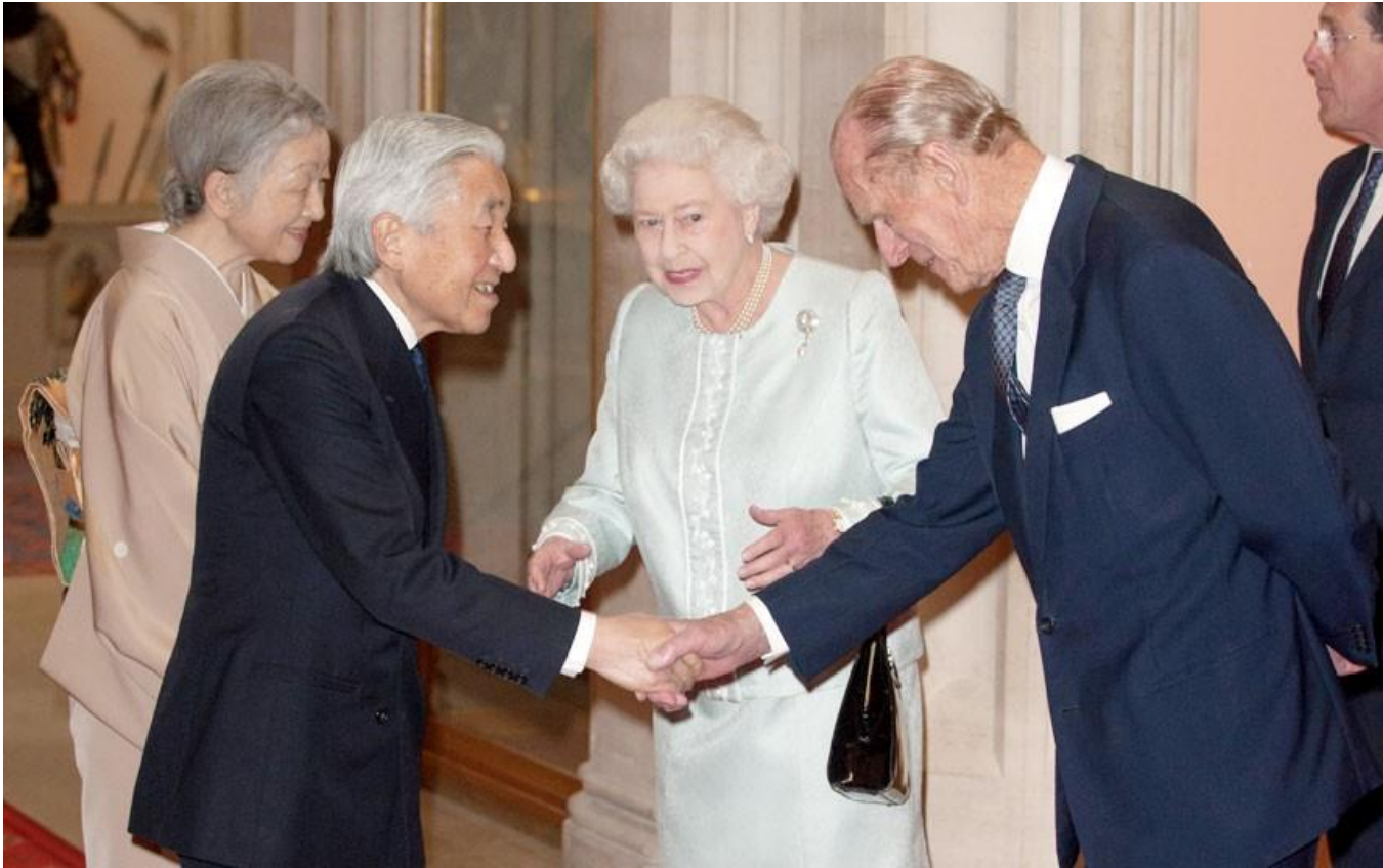
Queen Elizabeth II エリザベス二世女王 Prince Philip, Duke of Edinburgh (1921-2021) エディンバラ公フィリップ王子