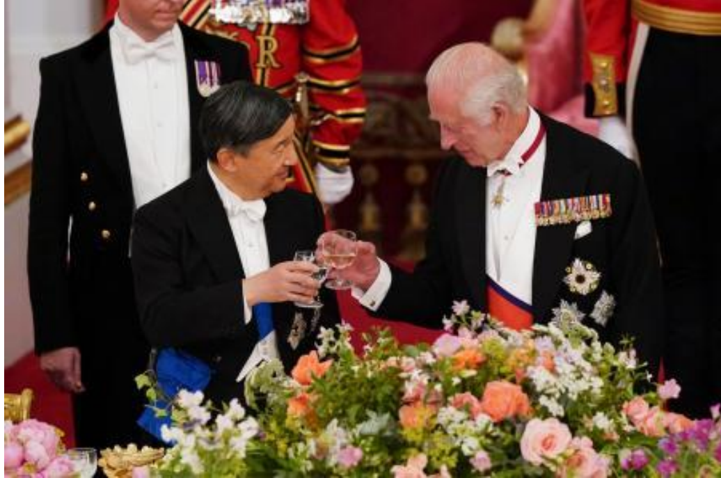
Emperor of Japan 今上陛下 (1960-)