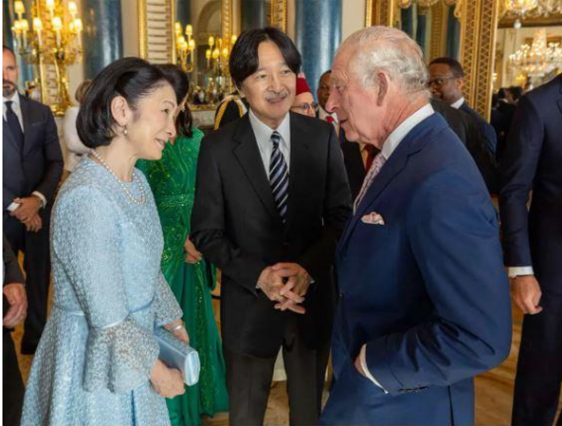
King Charles III チャールズ三世国王陛下 (1948-) Crown Prince Fumihito 皇嗣秋篠宮文仁親王殿下 (1965-) Crown Princess Kiko 皇嗣妃 紀子殿下 (1966-)