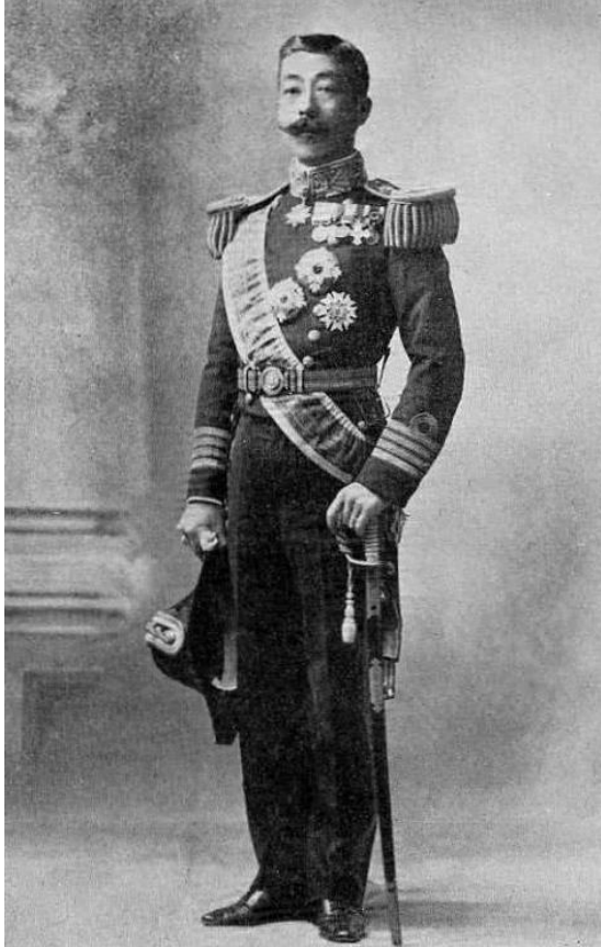
Prince Yoshihito of Higashifushimi 東伏見宮依仁親王 (1867-1922)