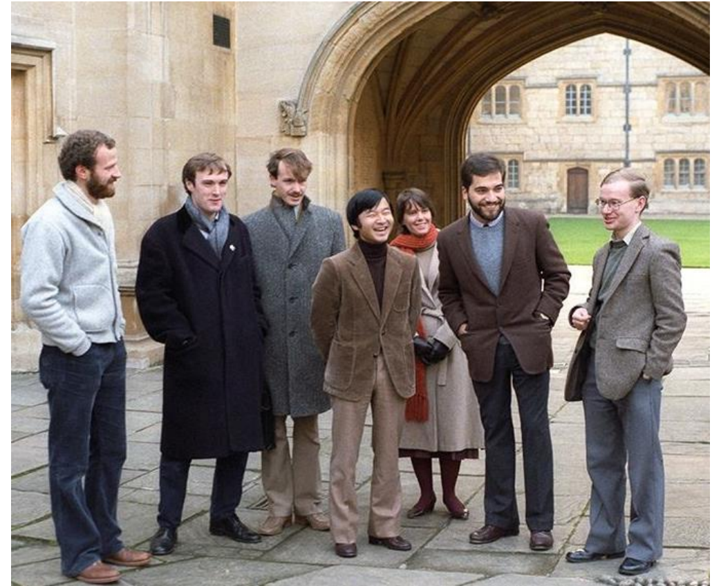
Emperor of Japan, then Prince Naruhito studied history of transportation at the University of Oxford as an MA student