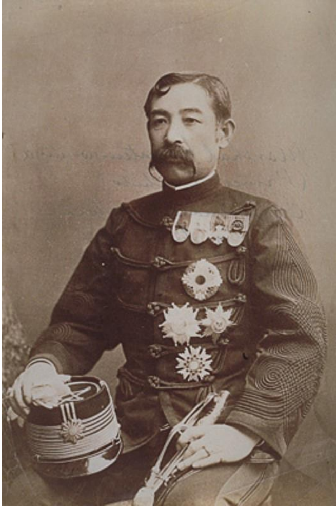
Prince Akihito of Komatsu