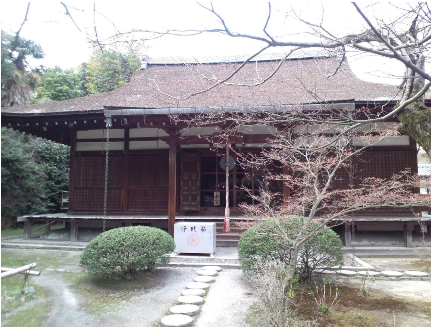
Kajū-ji Temple in Kyōto ( one of a monzeki temple)