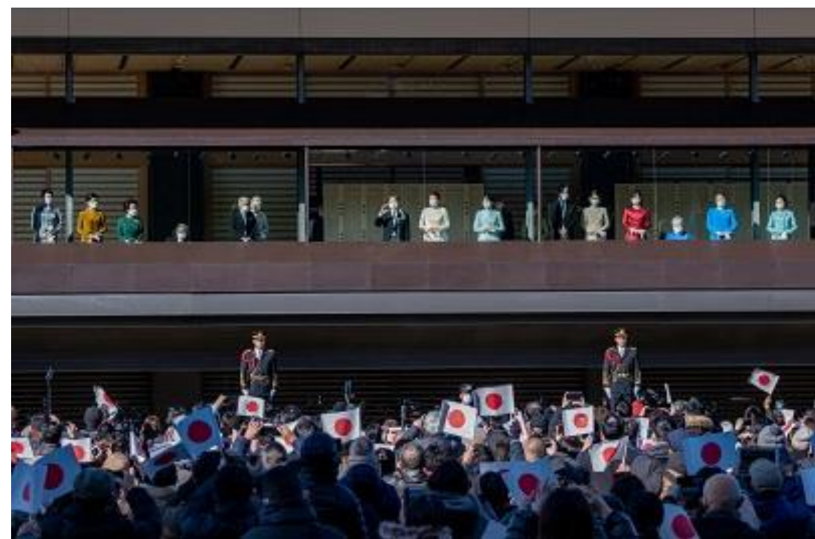
Imperial Family of Japan in January 2024