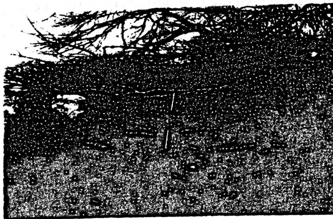
Plate 1: Cemetery from UngwanShabbu

Another material culture from the site is the possible place of burial situated at the northwestern part of the site. This was characterized by the presence of graves with head markers (stones) placed at the edge of some graves, while some without markers. The location was characterized by the presence of red dried leaves from trees that surrounded the location and an abundance of potsherds scattered over the area. The place is located 2meters north east of the protrude buried pot and this was measured 14.7m in length and 8.34m in breadth.