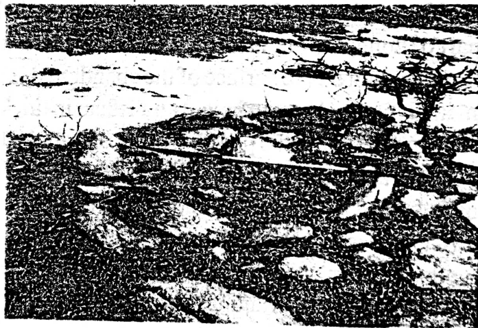
Plate II: Granary Foundation from Plate UngwanShabbu

Other important features on this part of the site were granary foundations. Two granary foundations were identified at this part of the site. The granary foundations were characterized by stone arrangement in circular shape and in smaller size compare to house foundations on the site. Granary Foundation A was identified at the north-western part of the site; this is situated at 2.45m south-east of rock hollow on the site and was measured 1.15m in diameter and 8cm height. Granary Foundation B was identified at the northeastern part of the site; situated 7.5m northwest of House Foundation and was measured 1.12m in diameter and 6cm in height.