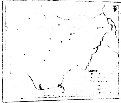
Figure 1: Zigam in Northern Nigeria