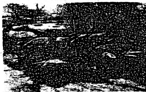
Plate III: House Foundation from UngwanShabbu

Another important feature on the site was a shrine. This was identified towards the centre of the site; the shrine was indicated by one of the field guides in the course of an archaeological survey of the site. The location of the shrine was characterized by the presence of stone arrangement in a circular shape, the presence of dried grasses and red leaves over the location and the abundance of potsherds at the location. There was notice of a unique potsherd with the representation of animal figures over the area. The shrine is measured 2.08m in diameter and 13cm in height.