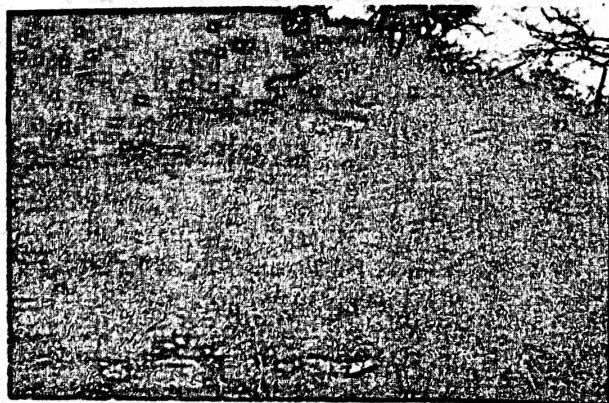
Plate IV: Compound Wall from UngwanNtibu

This part of the site is also characterized by the presence of compound walls. There were identifications of compound walls that served as the demarcation of zones on the site. The compound walls were identified at both the Northwestern and northeastern parts of the site and were mapped accordingly. Northwestern wall served as the demarcation between the 1 st clan and 2 nd clan. The wall was arranged with stones in linear shape and joined with big rocks that served as the continuation of the defensive wall. The visible stone arrangements were mapped and measured 8.4m in length and 65cm in height. The southeastern wall served as the demarcation between the 2 nd clan and the 3 rd clan. The visible stone arrangement was mapped and measured 6.82m in length and 2.21m in height.