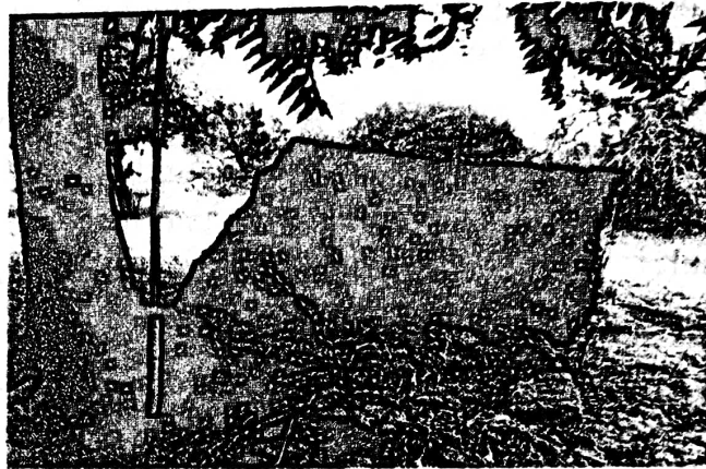
Plate VIII: Ruined Building from UngwanTsurago

The ruined building was also identified as part of features on the site. This was identified at the southwestern part of the site. The ruined building was characterized by the remnant of mud building which was circular and located closer to the exit of the abandoned settlement. The ruined building was measured 3.21m in diameter, 1.23m in height and 18cm in thickness.