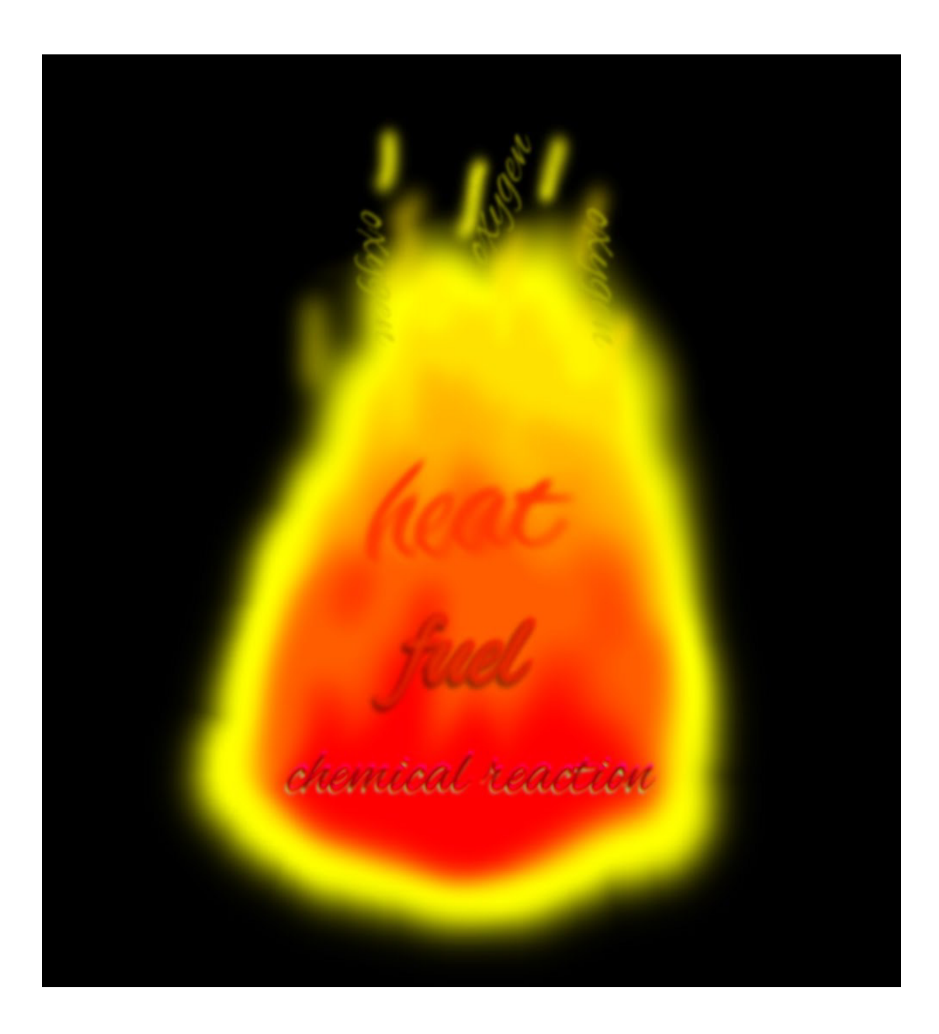
(Artistic rendition of the fire tetrahedron. Created for my thesis by my 11-year-old.)