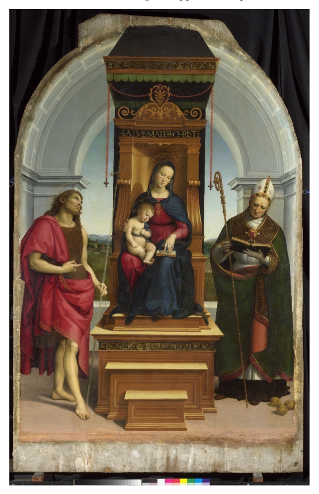
Fig. 2 Raphael, The Madonna and Child with Saint John the Baptist and Saint Nicholas of Bari ( The Ansidei Madonna ), 1505, Oil on poplar, 216.8 x 147.6 cm, London, The National Gallery (reproduced with permission)

Aretino's Perugian cityscape is reconstructed by triangulating his later letters, which recall his youth, the publication of the Opera nova , and the significance of the addition to the Caporali altarpiece. What we discover is not only the plurality of Aretino's informal training in the humanities during his years in Perugia, but also their complex cultural interfusion. The city is recalled as an earthly paradise of intermingling music, art, poetry, learning, and intense friendships – Aretino paints a picture of Perugia as a nostalgic haven against his present disillusion, to which he can return via his epistolary. It is a cityscape organized not by topography, but by ethnography. There are of course