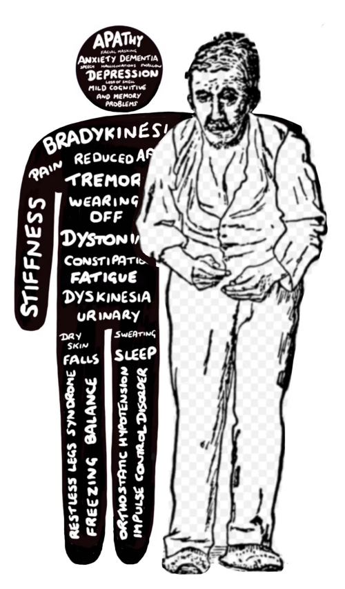
Figure 2 Visual representation of difficulties associated with Parkinson's next to an 1886 illustration.

2021; Simpson, Lekwuwa, et al., 2013; Suzukamo et al., 2006; Zarotti et al., 2021). In this regard, Figure 2 presents a widely adopted historical illustration of an individual with Parkinson's from 1886 next to the abovementioned visual representation of difficulties linked with the condition.