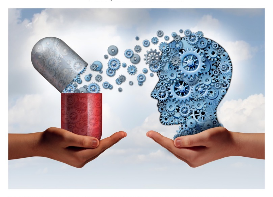
The relationship between feelings of control, low mood, and medication adherence in people with Parkinson's