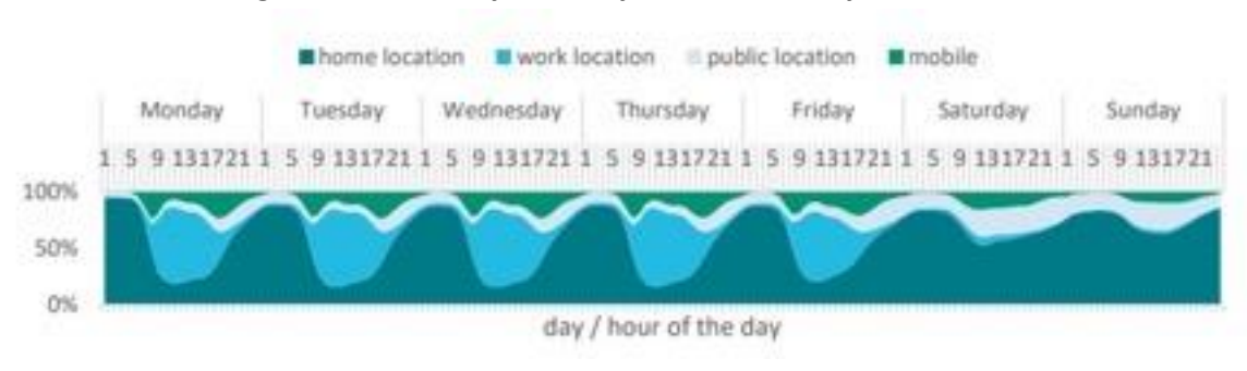
Figure 2. Availability of EVs by location and day of week