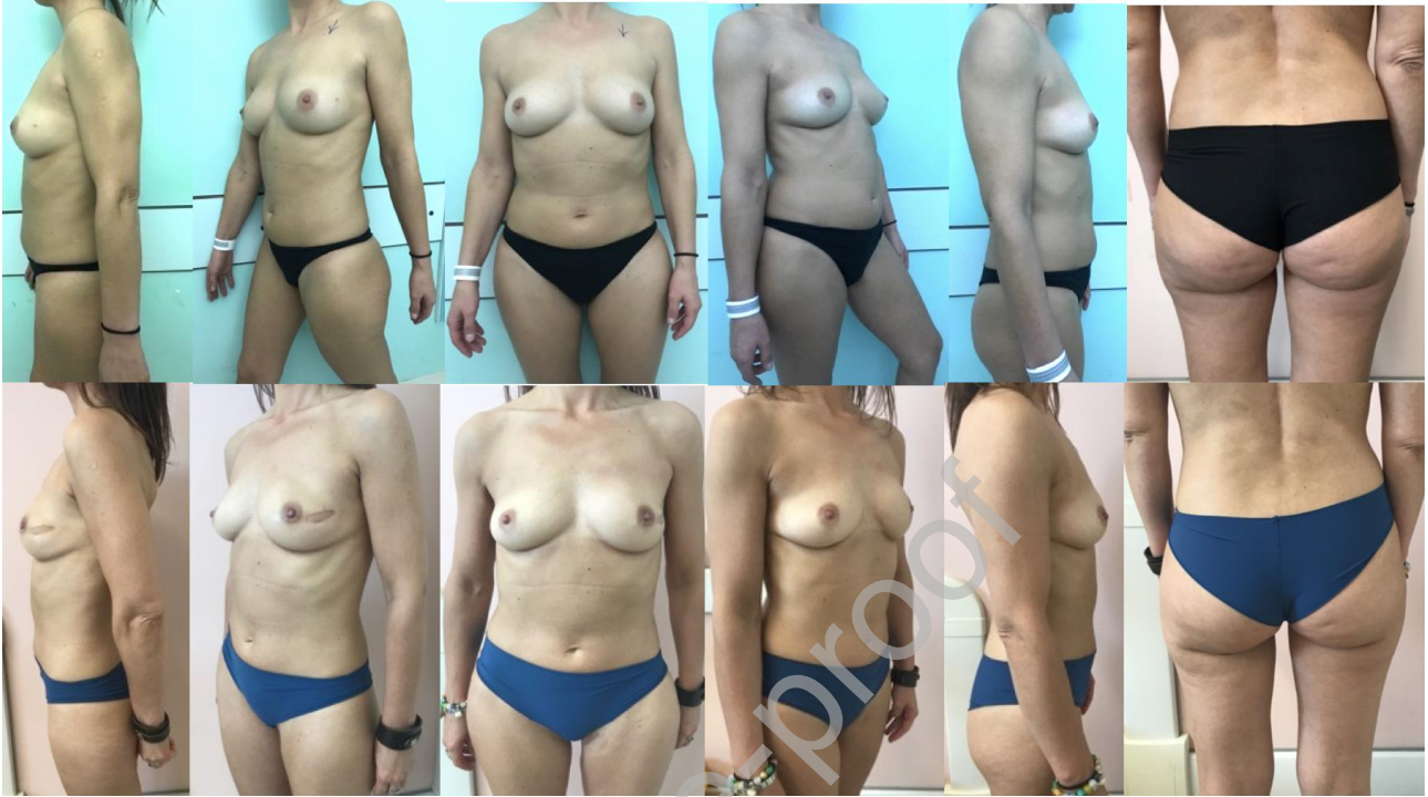
Figure 3 A 52 years old woman underwent left nipple sparing mastectomy followed by immediate breast reconstruction with a right PAP flap. Upper row: preoperative view. Lower row: 14 months postoperative view.

postoperative scores are higher than the preoperative ones in every domain with a statistically significant difference in the satisfaction with breast domain ( p= 0.0016 ).