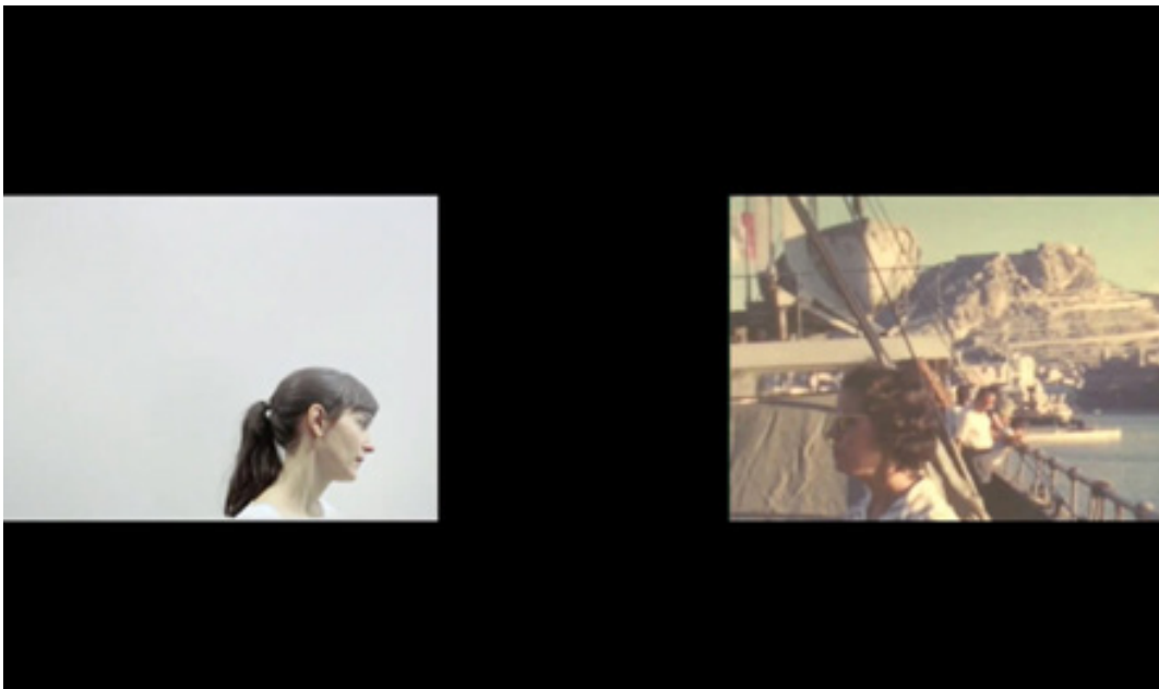
Fig. 2 Screenshot from Let's Reset the Clock , 2'37" colour video.

Let's Reset the Clock also constitutes a reflection about images. It is part of a broader set of artworks in which I question my colonial European identity through the use of my grandfather footage. My family fled Franco's Spain to migrate to Algeria at the time it was a French territory. I only know this