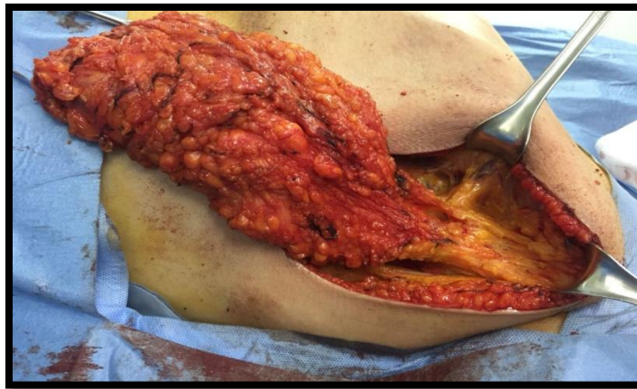
Figure 5: Intraoperative image shows the flap pedicle. The flap is on the site of the defect superficially.