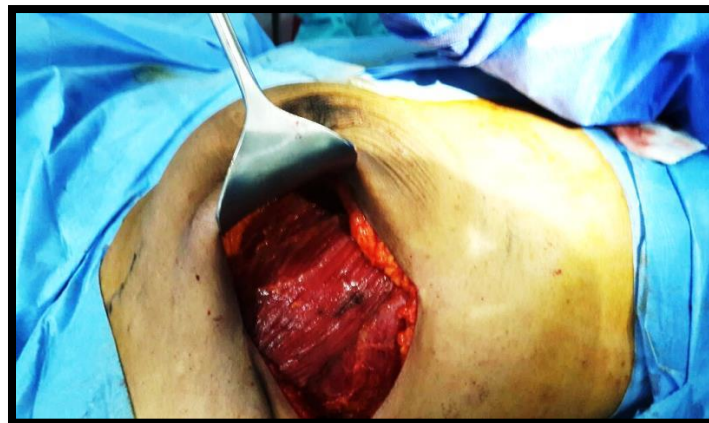
Figure 3: Intraoperative image shows the site of the defect after the resection.