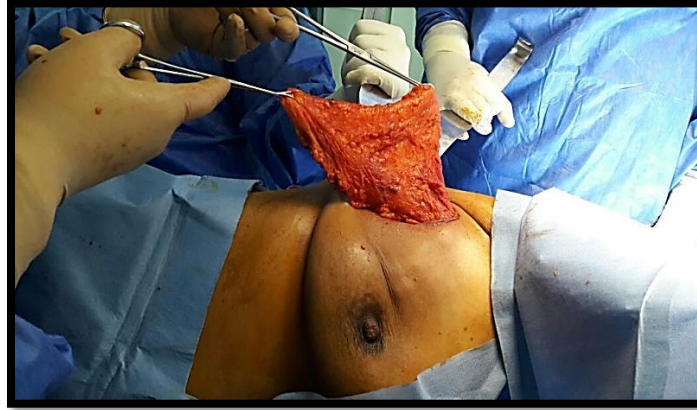
Figure 4: Intraoperative image shows delivery of the flap through axillary incision.