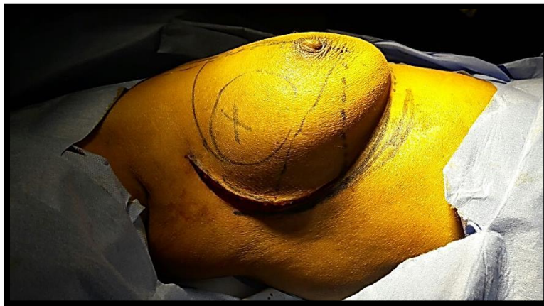
Figure 2: Intraoperative image shows the incision and flap elevation also x indicates the site of the tumor.