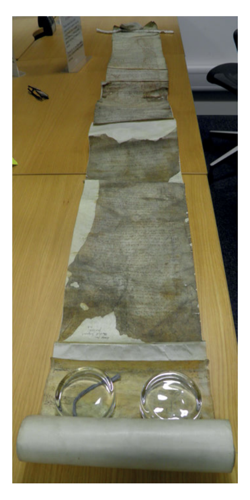
Fig. 8: Unrolled chancery roll.

arranged, with case following case according to the dates at which hearings occurred, but with marginalia identifying each entry by its particular county.<sup>92</sup> The rolls dealing with royal finance were in some instances chronological, as with the receipt and issue rolls recording payments to and from the exchequer. The pipe and memoranda rolls, however, were differently organized. The pipe rolls were arranged county-by-county, but enrolled in no fixed order (say from Kent to Yorkshire) but roughly according to the date at which each sheriff accounted, from Michaelmas onwards. The exchequer memoranda rolls were arranged according to a series of criteria determined first by the basic type of business transacted, these sub-sections then arranged in more or less chronological sequence according to the principle terms at which the exchequer convened,