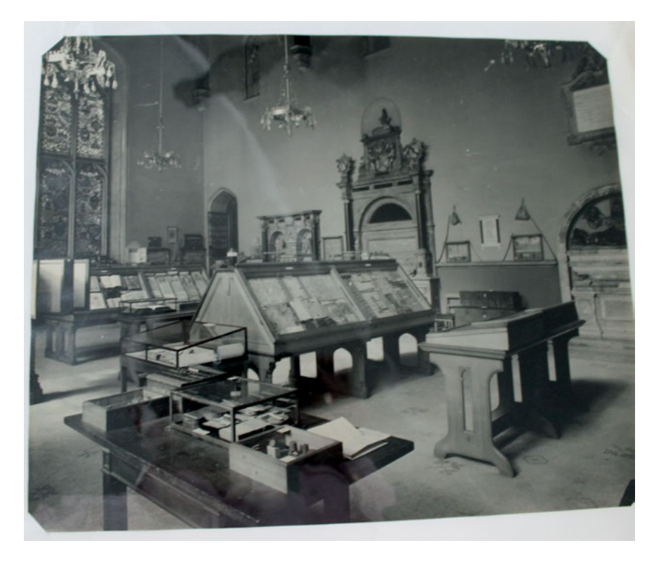
Fig. 2: Display in the Public Record Office Museum, c. 1910.