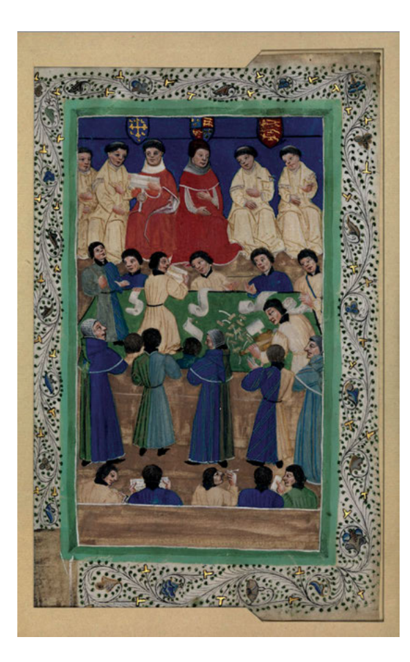
Fig. 3: Whaddon Hall drawing of the court of chancery.

and Scotch rolls.<sup>29</sup> For the vast majority of the king's subjects, meanwhile, the rolls remained inaccessible: symbolically powerful yet essentially mysterious.