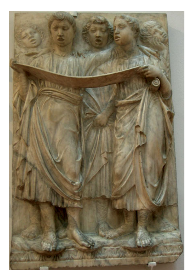
Fig. 7: Detail from Luca della Robbia's cantorie , Florence.

equivalent to the binding of a modern codex, but with the roll itself still 'openable' in essentially the same way as a book.<sup>91</sup> It was precisely this format of enrolment, head-to-head, that was adopted not only in the exchequer but in the king's law courts, all of which continued to produce rolls that were in essence monstrously oversized books presented 'sideways on'. Rather like the giant liturgical rolls or codices used by choirs (portrayed most famously in Luca della Robbia's cantorie in the Duomo at Florence), they possessed a further advantage in that they could be consulted from two or three sides and hence by upwards of two or more readers simultaneously (fig. 7). Not only this, but with only a stiff layer of polished sheepskin rather than heavy wooden boards to serve as their outer-covering, even when sewn up into rolls, they remained far lighter, and hence more easily transportable than any book of an equivalent size. This would have been a distinct advantage for records of an office like the exchequer that, even as late as the fourteenth century, continued to migrate between London and York. With their docquets and annotated feet, moreover, the rolls prefigured such later