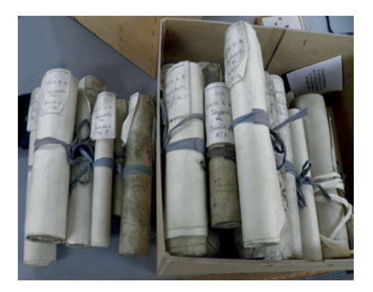
Fig. 6: A selection of the rolls used for the Book of Fees.

making up the so-called trésor des chartes stored in the shadow of the Sainte-Chapelle, albeit here as an essentially closed memorial rather than, as at Westminster, a still functioning part of royal government.<sup>75</sup>