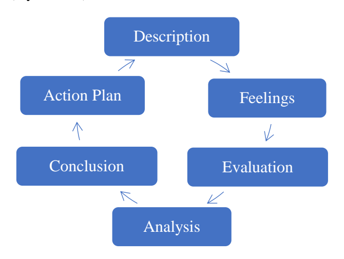
Figure 3.1. Gibbs' Reflective Cycle. Adapted from "Reflection, Reflection, Reflection, Reflection. I'm thinking all the time, why do I need a theory or model of reflection?", (Dye, 2011).