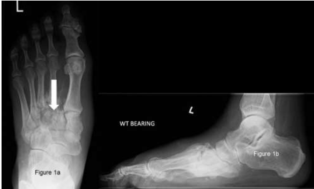
Figure 1a and 1b – Left foot AP and lateral radiograph demonstrating midfoot collapse, widening of the 1st and 2nd MT interspace.

1 2 3 4 5 6 7 8 9 10 11 12 13 14 15 16 17 18 19 20 21 22 23 24 25 26 27 28 29 30 31 32 33 34 35 36 37 38 39 40 41 42 43 44 45 46 47 48 49 50 51 52 53 54 55 56 57 58 59 60