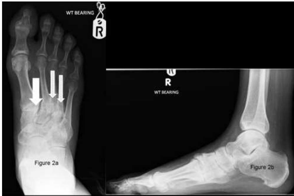
Figure 2a and 2b – Right foot AP and lateral radiograph demonstrating erosive arthropathic changes of the tarsometatarsal joints – in particular the first– with reduction in joint space and sclerosis(solid arrow). In addition, there are ununited fractures at the base of the third and fourth metatarsals (striped arrows).”

1 2 3 4 5 6 7 8 9 10 11 12 13 14 15 16 17 18 19 20 21 22 23 24 25 26 27 28 29 30 31 32 33 34 35 36 37 38 39 40 41 42 43 44 45 46 47 48 49 50 51 52 53 54 55 56 57 58 59 60