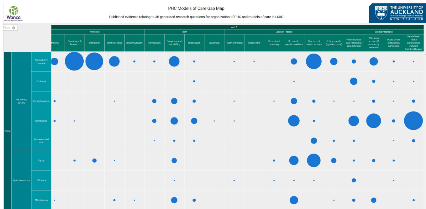
Figure 3 Static version of gap map of studies for model of care.

question were coded for two axes. Seven global regions (Europe, Eastern Mediterranean, Asia Pacific, South Asia, Africa, North America, South America) and a list of all LMICs were included as filters for the map.