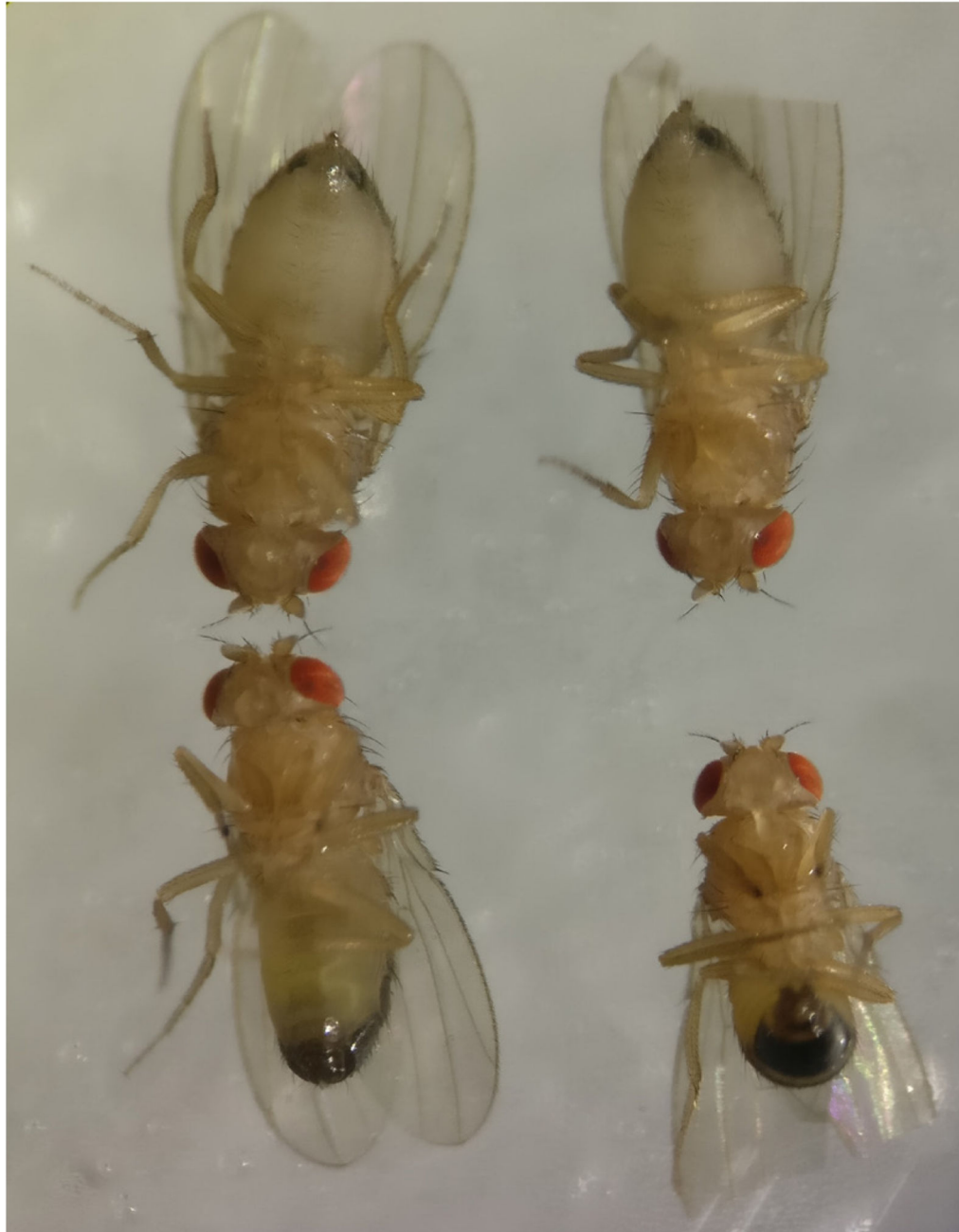
Figure 2. Adult morphology of Drosophila melanogaster . Clockwise from top left: Non-wing clipped adult female, Wing clipped adult female, Wing clipped adult male, Non-wing clipped adult female.