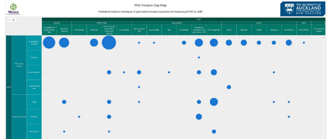
Figure 3 Static copy of gap map. PHC, primary healthcare.

being developed by the World Bank. A static version is shown in figure 3. An interactive web-based map was also generated (Gap Map finance) which presents both heat-map and bubble-map versions, includes filters for LMIC and for global regions, and enables viewing of all studies in a cell by clicking on the bubble.