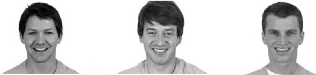
Fig 1. Photographs from the Chicago Face Database (Ma et al. 2015) used for the 3 critical dating profiles, from left to right, photo 1, photo 2 and photo 3.

like the type of person I'd want to settle down with" and "If Mike approached me on a night out, I'd go home with him" indicate the extent to which Mike was desirable to participants for long-term romantic and short-term sexual relationships respectively. Additionally, 2 statements were included which measured the extent to which participants would cooperate with the individual depicted in the dating advert (see supplementary materials: appendix 2 for all statements). For example, "If Mike asked me for help, I'd make an excuse as to why I was not able to". All statements were responded to using a 7 point Likert scale, ranging from strongly disagree to strongly agree and were presented to participants in the same order.