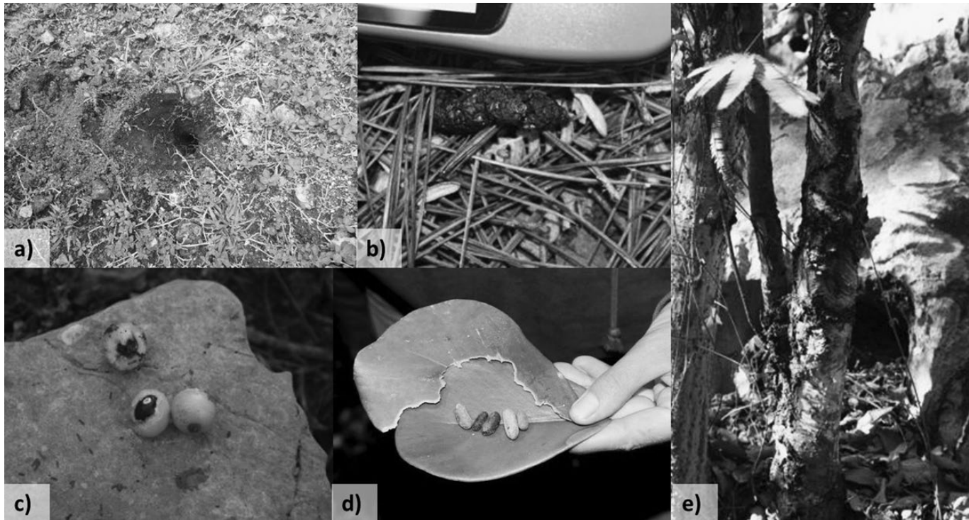
Fig. 2. —Hispaniolan solenodon ( Solenodon paradoxus ) field signs: a) conical-shaped foraging “nose-pokes”; b) feces. Hispaniolan hutia ( Plagiodontia aedium ) field signs: c) gnawed fruit; d) chewed leaf and fecal pellets (photo, Mongabay.com/Tiffany Roufs); e) gnawed bark on tree trunk.

sometimes used to detect presence (e.g., Howe 1974 ); however, the Hispaniolan hutia is semiarboreal, and no urine marks were detected during surveys. Indirect signs of any age were used to confirm presence of species within survey plots, as the aim of the study was to understand presence of native mammals in different landscapes rather than fine-scale temporal habitat or resource use. Evidence of non-native mammal species was not recorded systematically.