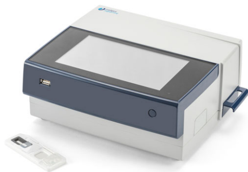
Figure 2. The Intelligent Fingerprinting Reader 1000 Unit and the Drug Screening Cartridge.

The process for analysis of the collected fingerprint sweat sample is as follows. The Drug Screening Cartridge activation buffer clip is depressed (see Figure 1)—this releases buffer solution into the sample collection cartridge. The sample collection cartridge is then inserted into the Reader 1000 analysis tray, as shown in Figure 2, and after following instructions, as directed by the Reader 1000 touch-screen, the results of the analysis of the test are displayed on the screen within 8 min of initiating the test. The result of each test gives a pass/fail for the presence of each drug, based on a cut-off for each analyte. For this study, the cut-offs for each drug detected using the lateral flow device were set at 190 pg for THC, 90 pg for BZE, 68 pg for morphine and 80 pg for amphetamine. The results obtained using the Drug Screening Cartridge and Reader 1000 can be printed to provide a permanent record.