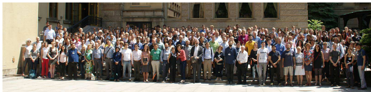
Figure 4: Quadruplex self-assembly! Conference delegates get together for a group photo.