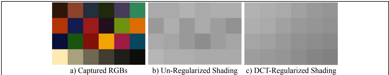
Figure 2: The shadings of the capture RGBs (a) are estimated by naïve ALS (b) and ALS with DCT smooth shading regularization (c).