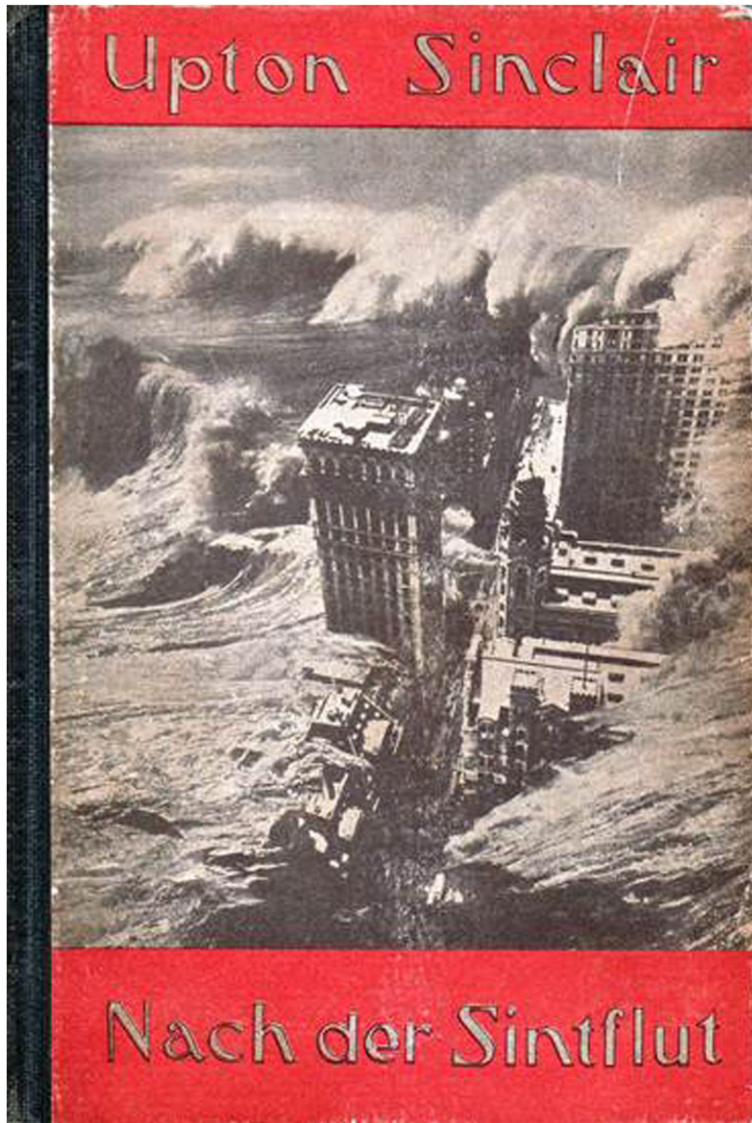
Figure 3 Upton Sinclair's Nach der Sintflut ( After the Flood ) with cover image by John Heartfield

familiar', a hidden order is order exposed (Rancière 2009a, 56–7). By contrast, symbolic montage directs the assembly of heterogeneous elements towards establishing 'a familiarity, an occasional analogy, attesting to a more fundamental relationship of co-belonging, a shared world where heterogeneous elements are caught up in the same essential fabric' (Rancière 2009a, 57).