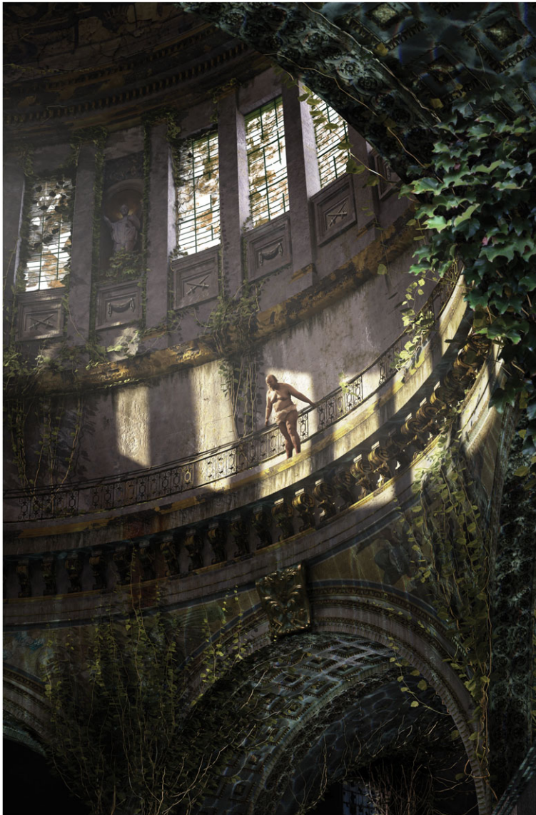
Figure 7 St Paul's – A Late Afternoon Plunge

Imperial hubris also began to inform concerted consideration of Britain's own future ruins. Sir John Soane, architect of the Bank of England, revelled in the image of his own building's ruined future, and Lord Macaulay wrote of a future New Zealand tourist contemplating a ruined London from the banks of the Thames (Dillon 2006). An imperial gaze directed towards the ruins of other, lost or disappearing cultures also informed colonial 'salvage' missions (Stoler 2008, 198), and the 'pleasure of ruins' (Macaulay 1984) is still deeply felt in a contemporary aesthetics of melancholy and a nostalgia