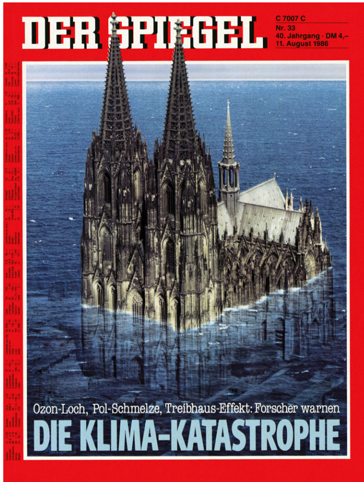
Figure 6 Front cover of Der Spiegel 33/1986, 'Die Klima-Katastrophe'

technological change. Progressive teleologies have been commonly rebutted by a cyclical conception of history which sees no rise without a fall. Cyclical understandings of time and of the inevitability of apocalypse have roots in a variety of cultural contexts, but Boia suggests that the rise of industrial modernity gave a particular valence to fears about the 'end of times'. As the pace of history accelerated, so fears about societal collapse gained currency and cities were imagined as the epitome of modernity's inherent vulnerabilities. Such fears evolved alongside – or were mediated by – fears about the environmental repercussions of such unprecedented changes in the human condition, with climate often functioning as an explanatory variable long before concerns about greenhouse gas emissions (e.g. Fressoz 2007; Locher and Fressoz 2013). In the nineteenth