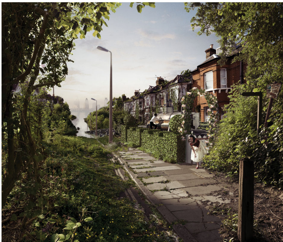
Figure 1 Honor Oak – Suburban Bucolia

In the next section, I briefly discuss the links between photographic realism, rhetoric and the visual discourses of climate change, before introducing the history of photomontage. Dada, Constructivist and Surrealist movements turned photography's realism against itself