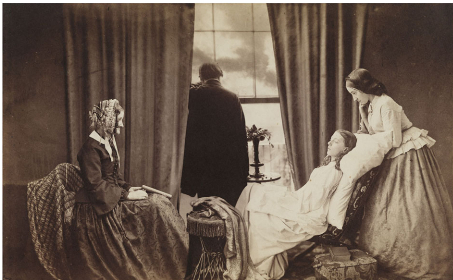
Figure 2 Fading Away by H.P. Robinson, 1888. Robinson combined five different negatives to create the image, particularly to enhance the view of the sky from the window