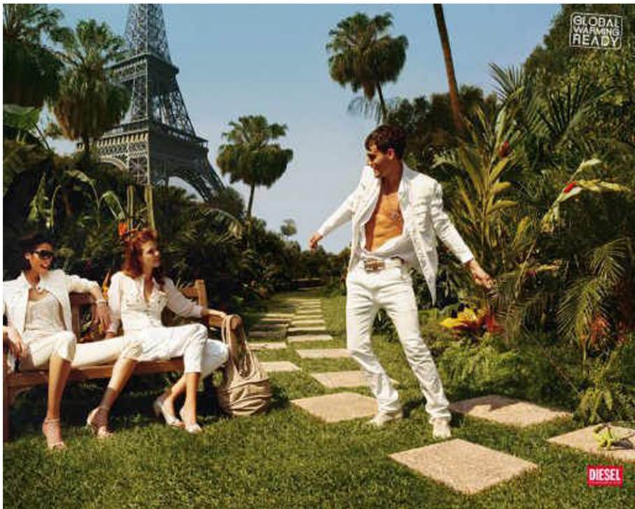
Figure 5 From the series 'Global Warming Ready'

Rancière's identification of dialectical and symbolic forms of montage helps to crystallise how the work of the monteur creates different kinds of spatial and temporal rupture, which are freighted with different political claims about sameness and difference, (dis)continuity, and the (non)linearity of societal transformations. Theodor Adorno was altogether more sceptical about the artistic and political power of montage, seeing it as an artistic capitulation 'to what stands heterogeneously opposed to it' through the admission into itself of 'literal, illusionless ruins of empirical reality ... for purposes of aesthetic effect' (Adorno 2004, 202–3). Adorno was writing in the 1960s, arguably long after photomontage had lost much of its oppositional-modernist punch, and 'the power of juxtaposition to shock people into novel and more reflective awareness' has, for Dillon (2004), long since 'faded into the daylight of TV and advertising uses' of montage techniques. Artists like Martha Rosler nonetheless bucked the