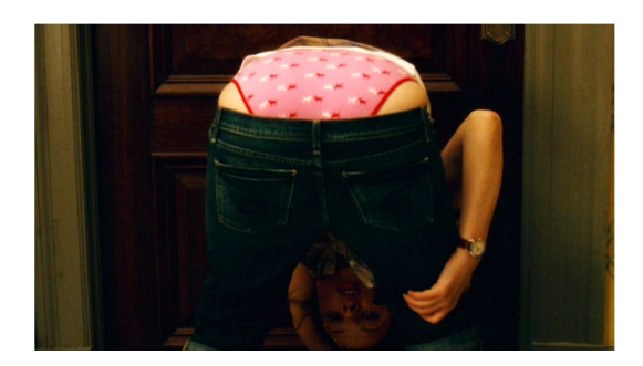
Figure 11: Endearingly incompetent Annie

In addition, she is also frequently characterised as a child herself. At Grayer's birthday party she sits next to him and both of them have the exact same sulking body posture, wear dark, festive looking clothes and silly party hats. When Grayer is ill Annie's mother has to come by and hold him while Annie watches helplessly. Annie is also strongly inspired by Bridget Jones, who is the prototype of endearing incompetence and clumsiness. In their first meeting, HH catches Annie in an embarrassing position. Grayer has pulled her pants down and locked her out of the flat. She has dropped her bag and forgotten the pram in the elevator. Her first view of HH is in form of a subjective shot. The camera is upside down and shoots through her legs. It then cuts to a close up of Annie's bottom and exposed underwear, mirroring the bottom scene in Bridget Jones's Diary . HH later on admits that seeing her like that immediately fascinated him.