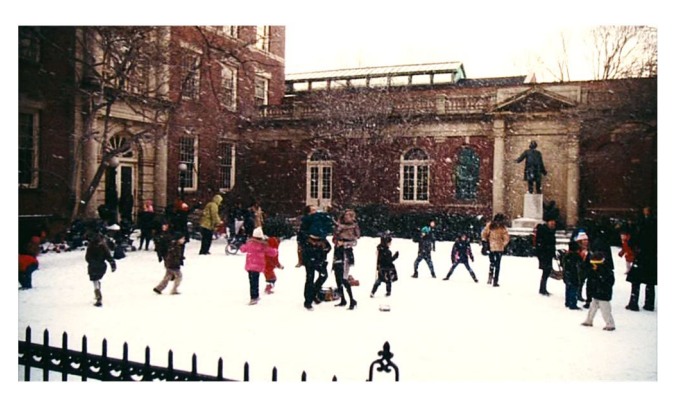
Figure 27: Romanticised happy end

background, the film offers a new ending in a very stereotypical form, not just allowing but even encouraging the viewers to read it as an unrealistic fantasy.