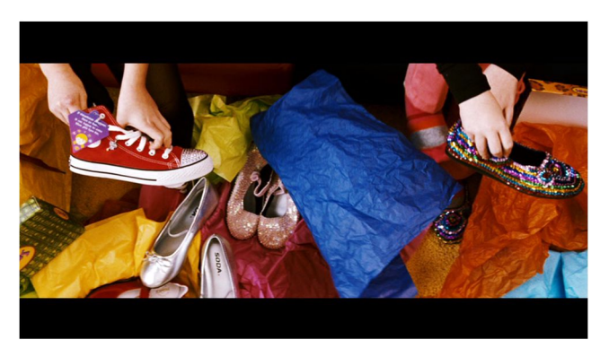
Figure 14: 'Shiny things'

Right from the beginning the visual display of fashion in the adaptation celebrates consumption by turning it into a spectacle. Rebecca's fascination with shops and consumer goods ('shiny things') is traced back to her childhood. The first scene begins with a close up on shoes that slowly come into focus and are then moved out of the frame. It is followed by a travelling shot that shows in a bird's eye shot girls trying on different kinds of very colourful shoes. They are also wearing colourful clothes and are surrounded by brightly coloured wrapping paper. Becky narrates in a voice over that there were real prices buying you 'shiny things' that did not last very long and mom prices that got you 'brown things' when she was a little girl. When she mentions the latter, the camera moves over brown rather solid looking shoes. It cuts to Becky's face who unhappily looks down at them.