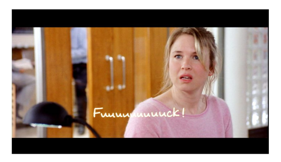
Figure 3: Bridget's thoughts

Like the novels, the film also strongly focuses on Bridget and uses filmic techniques to stress that this is her story. Inspired by the TV show Ally McBeal, Bridget Jones Diary also visualises her thoughts and fantasies. When Daniel overhears her having a private telephone call at work, Bridget pretends to be on the phone with a well-known author. Daniel points out to her that the author is dead and Bridget's thought appears in writing on the screen: 'Fuuuuuuuuuck!' Similarly, when Daniel flirts with her for the first time, Bridget expresses her thoughts in a voice-over: 'Mustn't read too much into it, though.' This is immediately followed by a visualisation of her contradictory thoughts in form of a fantasy sequence in which she imagines Daniel giving a speech at their wedding, referring to the messages as the starting point of their relationship.