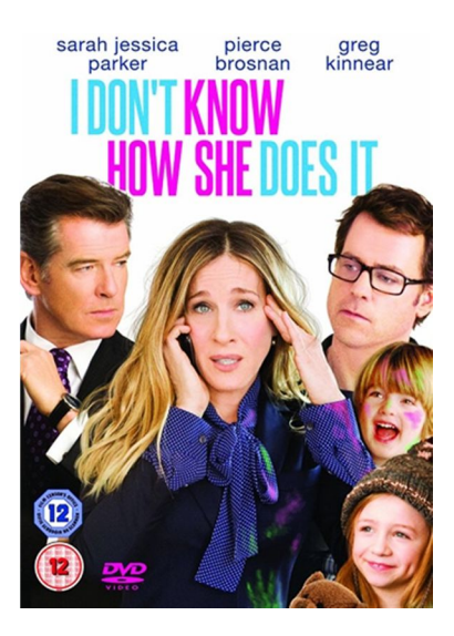
Figure 26: I Don't Know How She Does It DVD cover 843

superhuman capacities.' The film stresses Kate's exceptionalism by contrasting her with stereotypical female characters who all fail in some aspects of their lives. Wendy, the stay-at-home mother, has to spend hours at the gym because she does not have anything fulfilling to do with her life. Single mother Alison fails at her household chores and Kate's assistant Momo is so focused on her career that she is incapable of emotions. Even the title of the film suggests that only Kate knows how to do it. On the DVD cover the words 'know how she' are pink while the remainder of the title is blue, already implying that this one woman has the necessary know-how to combine a family with a career.