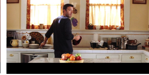
Figure 17: Selfish husbands