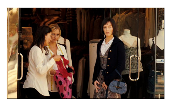
Figure 22: Prudie's underwear is revealed in public

The montage sequence at the beginning of the film is typical for multiprotagonist films because they often show that the main characters are linked with each other in a complex network. Wendy Everett explains that the notion of people being connected in networks is not new. However, 'What is new about today's understanding of networks, and what makes it impossible to approach them with simple linear graphs (in mathematics or physics) or with straight forward linear narratives (in films or novels), is the recognition of their essential complexity. 675 The characters are linked in the montage sequence by their mishaps but also by the fact that they all live in Sacramento. The first scenes show streets, houses and a highway sign which identifies the setting. The city as a setting functions as '... a privileged site of modernity and change.'676 Thus, while it also indicates the complexity of modern city life, the film makes an effort to stress that despite the size of the city people are linked through their relationships with each other. It attempts to reproduce the intimacy often associated with Austen's novels that focused on a few families in