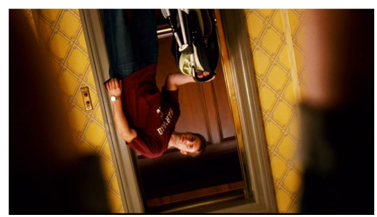
Figure 12: Meeting Mr Right