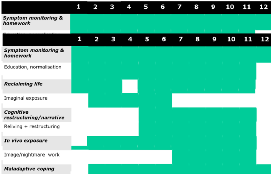
Figure 2. Gantt chart of treatment elements over the course of sessions. Note. The Gantt chart is a guide through the stages of treatment; number of sessions for each element is based on the child’s ability to complete the relevant section. Also, elements are illustrative, for example, image/nightmare work is required only if clinically indicated.

in the accident was not permanent. He would happily head the soccer ball and experience no pain or side effects in his neck or shoulders as a consequence of doing so.