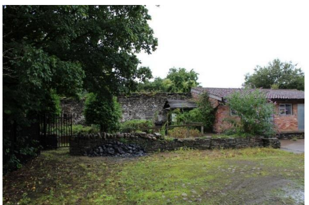
Figure 18: Forest Farm (daytime): the courtyard

The audience walks onto the courtyard's patterned cobblestones (Figures 18 and 19) and a new guide closes the gate behind the audience, which – in another arresting sonic moment like the well's iron cover – groans shut and then reverberates loudly. In the courtyard are a group of eight dancers in green caped gowns who have been dancing for a few minutes before the audience arrive. Indeed, audience may have already heard their pounding feet for