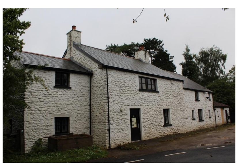
Figure 2: Forest Farm (daytime): the farmhouse

The audience arrives at the Forest Farm carpark and are led by lantern down the closed public thoroughfare. On one occasion, a toad crawling across the path to the shock of some visitors is an unexpected but invaluable impromptu moment. Indeed, this surprise amphibian