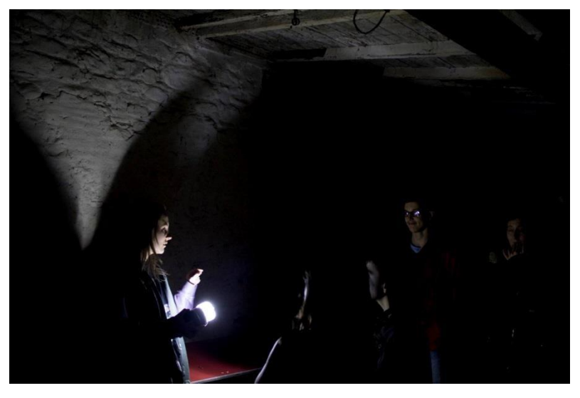
Figure 24: The final story in the barn...

Led away rapidly, the audience passes the gypsies who look anxiously into the crowd, searching for their evidently escaped victim. The hitherto headlong narrative now seems to be