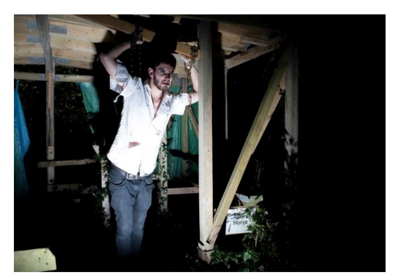
Figure 16: The victim chained to the crossbeam... (Scott Ridley)

immersing audiences into the world of popular, doom-laden horror. There are a few moments of amusing banter with the audience, wherein the gypsies look for appropriate 'subjects' for their moonlit ritual, rejecting various candidates for being 'too young...' or 'too unhealthy...'