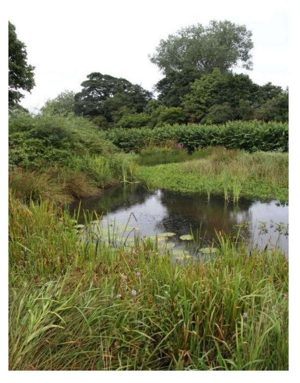
Figure 25: Forest Farm (daytime): the meadow and ponds

Don't panic, we're perfectly safe... What an amazing thing to witness...! The legends must be true!