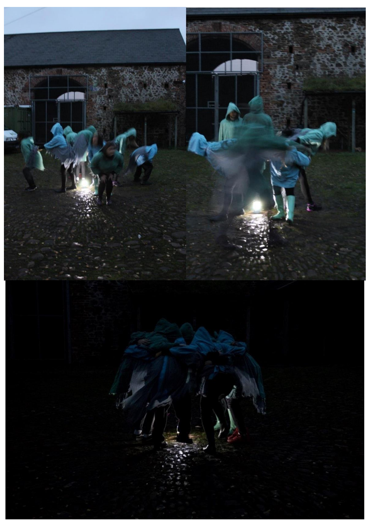
Figures 20-22: The Moon Ritual Dance