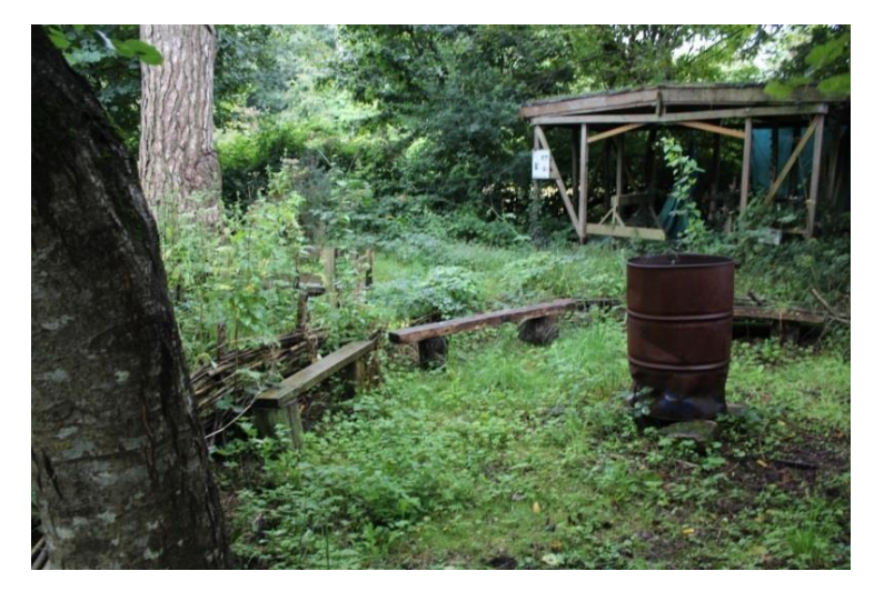
Figure 14: Forest Farm (daytime): the open area with brazier

in the ripped tee-shirt was a jump moment of suspense, this was disarmingly comic. This is another example of the Grand-Guignolian douche écossaise : partly a moment of light relief, it also had an important experiential function: regardless of the disarmingly cheerful guide, the audience must now be aware — with disquiet or delight — that they