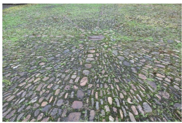
Figure 19: Forest Farm (daytime): the courtyard cobblestones