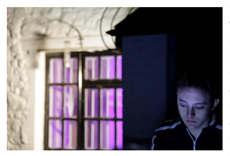
Figure 13: The story of the well...

In the story of the well, the protagonist realises his wish is now a curse. Taking another drink to undo his wish, he falls into the well. After this tragedy, an iron hatch was put into place. People have heard scratching and growling... Listen carefully ... (a moment of silence in