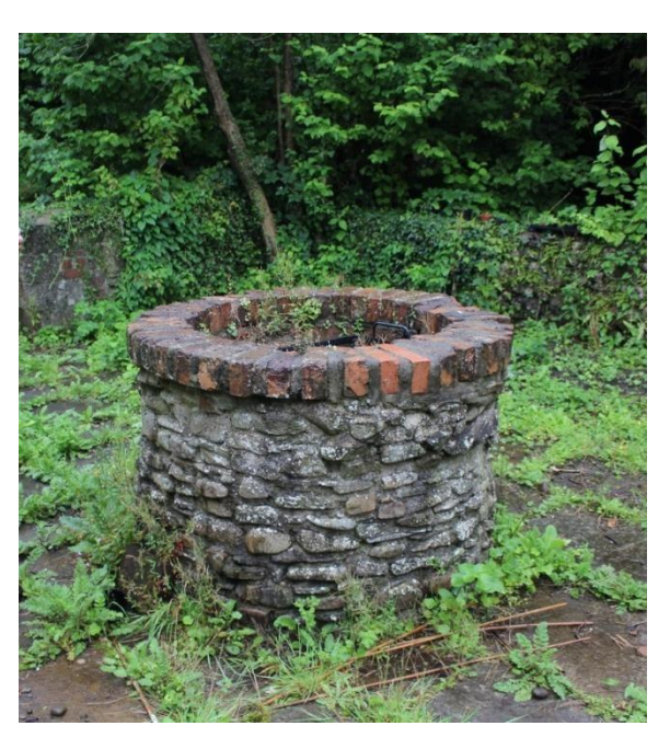
Figure 10: Forest Farm (daytime): the well

been mauled (Figure 9). The wound might be a clue as to what is to come: only one kind of creature could have caused those slash marks... The fact this remains unsaid is a storytelling