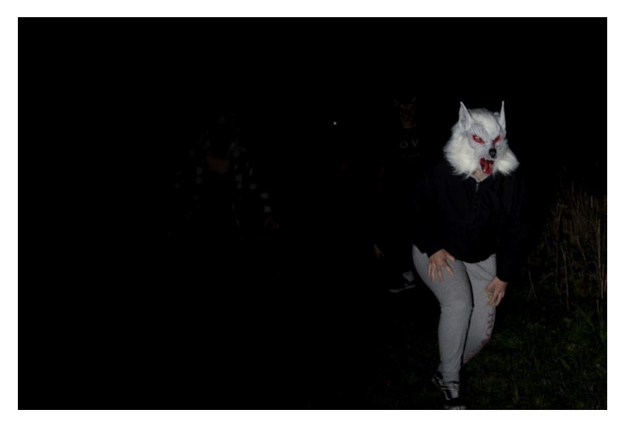
Figure 27: Run for your lives...!

'hypermasculine' and yet she also signals how monstrous hypermasculinity can reveal 'the fragility of the category of masculinity and the ways in which such masculinity may be