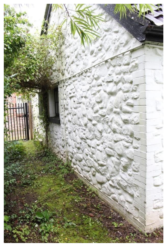
Figure 4: Forest Farm (daytime): turning the corner...

in one spectral moment: the lantern of the guide chatting informally to the queue momentarily illuminates the 'Farmer': a be-suited man with a flower as purple as wolfsbane in his lapel. Only a minority detect the 'apparition' but those who do discus it, causing a mood of