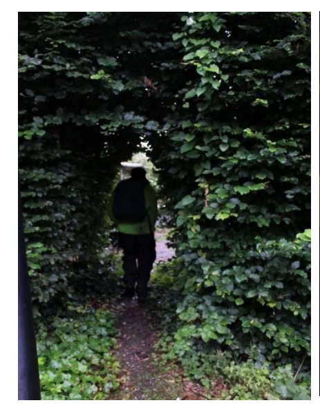
Figure 7: Forest Farm (daytime): entering the bower...