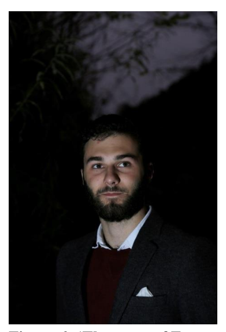
Figure 6: 'The story of Forest Farm...' (Luke Rose)

forms a natural cage and the audience are led inside. Two storytellers greet the crowd and recount the story of the Farm (Figures 5 and 6). A seemingly factual account of the farm's owners, the Sullivans (a deliberately fictional invented name), begins to shift into the uncanny: the audience is told of a fire that happened in the 1940s (which, as some locals might know, did happen) that killed all the residents (in fact, no-one died). This was an example of effective uncanny storytelling: the real becomes gradually distorted. During Halloween, the truth need not get in the way of a creepy story. After this tragedy, when the farm was rebuilt, Mr Sullivan was seen working on the farm, well-dressed 'in a suit with a purple flower', despite