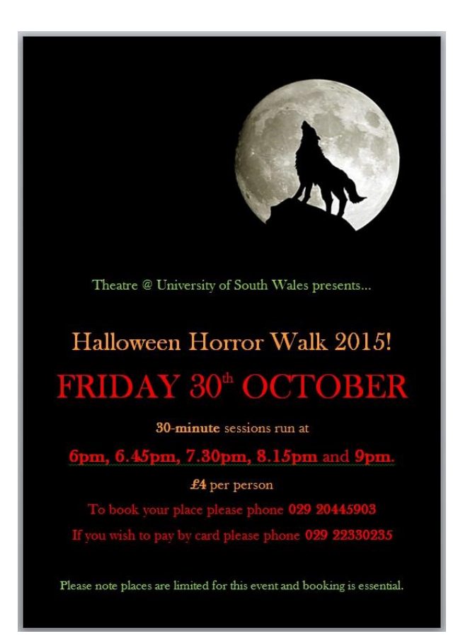
Figure 1: Poster for the 2015 Halloween event created by the Drama Department at the University of South Wales for Cardiff City Council

As Sconduto indicates, the werewolf can inhabit the wooded areas that border or surround the urban domain, precisely as Forest Farm does. For our audience, it is a short and simple