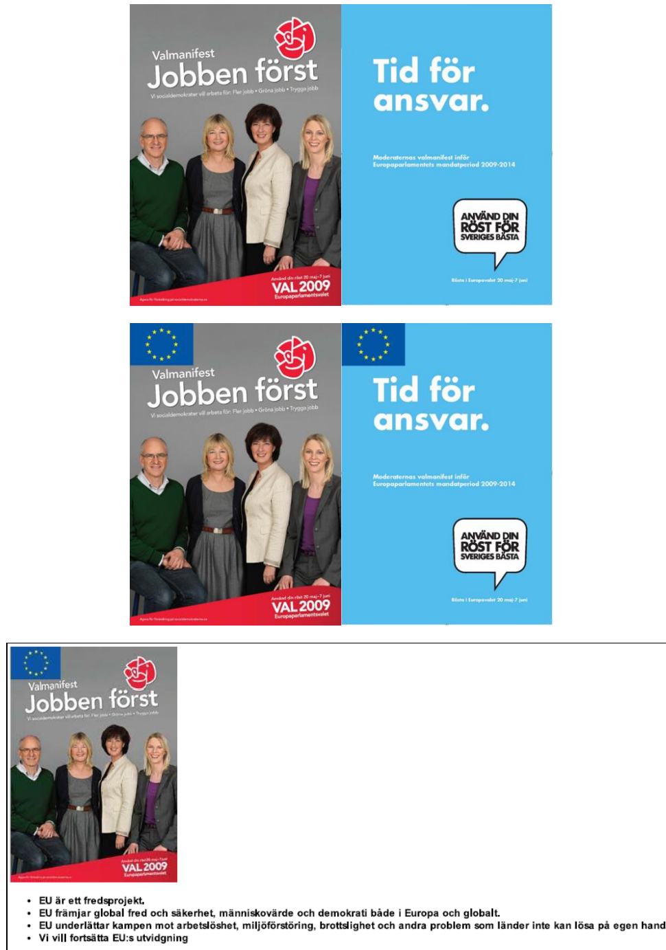
Figure 1. Visual manipulation

Note: The top row presents the original party materials, the middle row presents the party materials with the added EU flag to the left corner, and the bottom row presents a screen shot example of the full manipulation. In this example, the text valence is positive (see complete translation in Appendix 1).