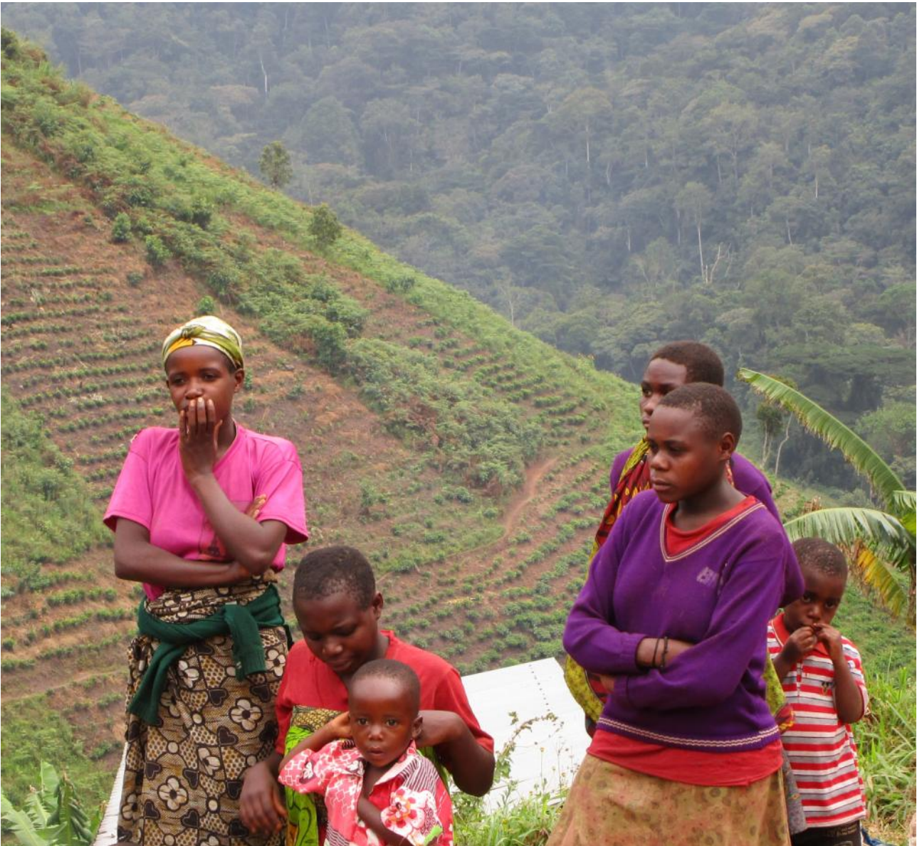
Discussions on the edge of Bwindi Impenetrable National Park, Uganda

existing legislation to gazette the area as a forest reserve, protect it for the community, have it adjudicated into individual parcels, and establish group ranches – all in the face of strong opposition from other groups.