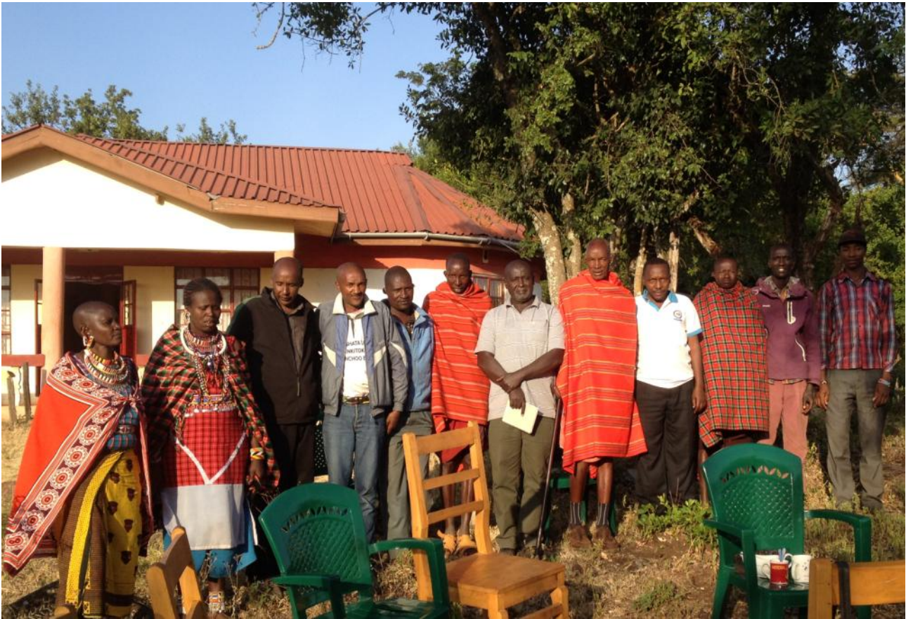
Entasekera Forest Protection Committee in Loita, Kenya

We hope the equity framework will be used in conjunction with existing tools to identify and address gaps as necessary and to develop modular approaches tailored to specific needs and contexts. That said, if resources are not sufficient to conduct social and governance assessments in full, a more focused “equity assessment” methodology – yet to be developed – could fill the gap.