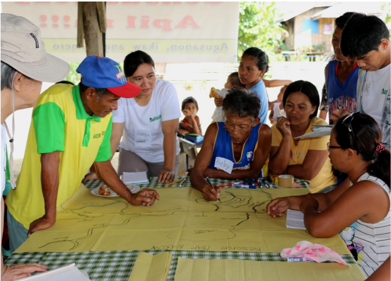
Resource Mapping by Manobo IP Community, Agusan Marsh Wildlife Sanctuary, Philippines