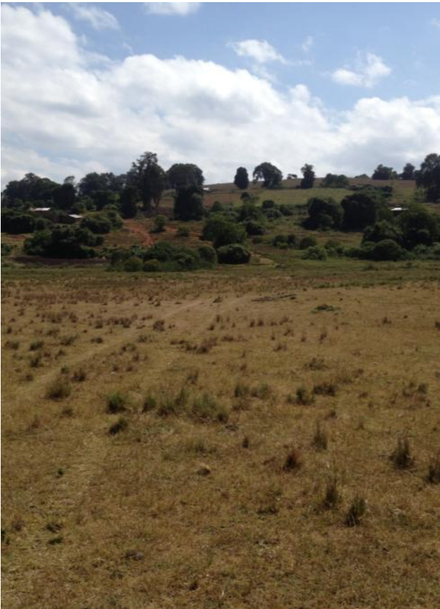
Encroachment in Loita Community Forest, Kenya

in – to start with certain key elements, such as participation in decision-making, provisions for resource access, and other benefit-sharing arrangements.