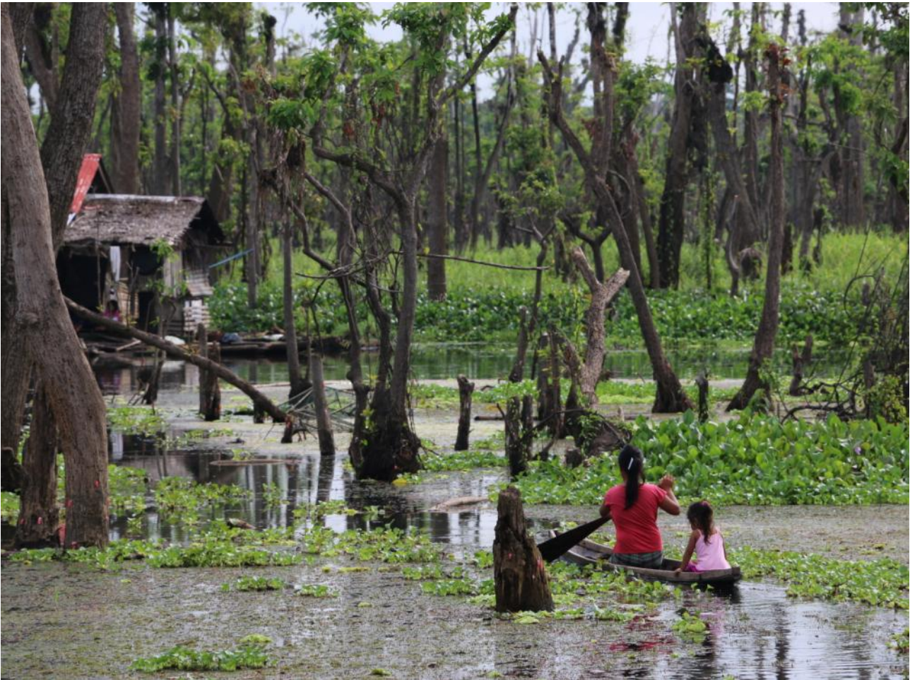
Agusan Marsh Wildlife Sanctuary, Philippines

opportunities, as is the case, for example, in the UNDP framework of governance principles (Graham et al., 2003). However, for the context of protected areas, IUCN and its partners have adapted and expanded the scope of these principles to include: legitimacy & voice, direction, performance, accountability, and fairness & rights (Borrini-Feyerabend et al., 2013). Although a wide range of governance assessment tools exists, none has yet been applied as widely in the protected area context as the management effectiveness tools. A relatively new addition to the toolkit is the Whakatane Mechanism, which has a particularly strong focus on situations of rights violations (Freudenthal et al., 2012).