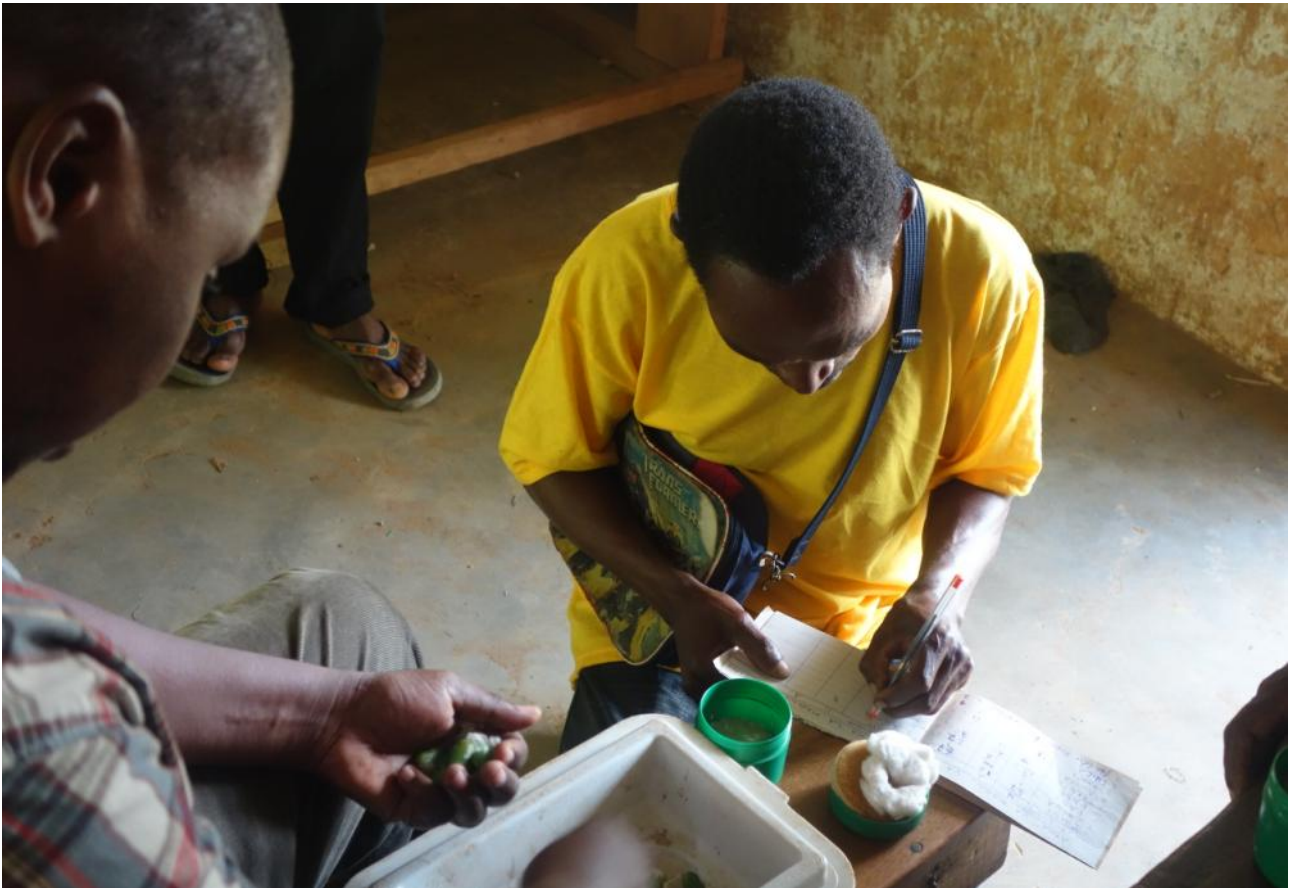
Farmer delivering butterfly pupae to co-operative

As outlined in principle 5, recognition refers not only to indigenous or marginalized groups, but rather to all 'relevant actors' who have a significant interest in the protected area. This includes the need to recognize (and counteract) the disproportionate influence wielded by some stakeholders, such as individuals keen to make a personal profit, powerful conservation actors or powerful development actors such as mining companies.