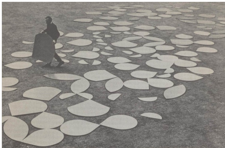
Figure 2. Timothy Drever. Four-Colour Theorum. Kenwood, 1969.

must relate to the area in which it is shown. Thus, it seems natural that ‘environmental art’ should be not just the latest fad of the art-world, but a bridge into the real world” ([18], p. 255). Robinson’s own exhibition piece was a series of large, flat, coloured shapes produced, again, according to geometrical rules, but here they were set down on the lawn and he invited the public to move, reorder, and experiment with new compositions to bring the work alive (see Figure 2). This echoed a previous interactive installation that he had exhibited indoors at Kenwood House the same year called “Moonfield” where visitors were invited to enter a darkened room with a black floor only to find their feet knocking black wooden shapes on the floor which they were encouraged to turn over revealing a white underside. As people made their way through the room new patterns of black and white emerged dependent on their physical interaction. “Moonfield is thus a new surface to be explored, and this exploration creates its topography”, the exhibition catalogue claimed ([17], p. 5). This topography that was created through the interaction between artist, artwork, and public was described as a “real space both in philosophic and social terms” ([17], p. 17).