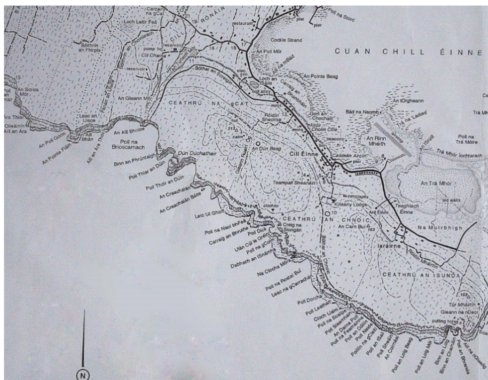
Figure 3. Map detail of south-east coast of Árainn. Folding Landscapes .

standard as those of the Ordnance Survey. For example, on its south-west side Aran is all cliff and on its north-east all beach, so the angle of vision that looks down on the island in his map is tilted slightly to the south west—what he calls a “seagull’s-eye perspective”—thereby capturing the shapes of the sea-cliffs (see Figure 3) ([34], p. 38). This was important to a fishing culture that navigated by these shapes, and that had their own names for many of the headlands that differed from the inland names that farmers had for the same features. By making his such an isolated study, Robinson was enjoying a freedom of singularity, beholden to no distant, administrative standard, something that of course recalls the surveyors’ rods he had created in London in 1972.