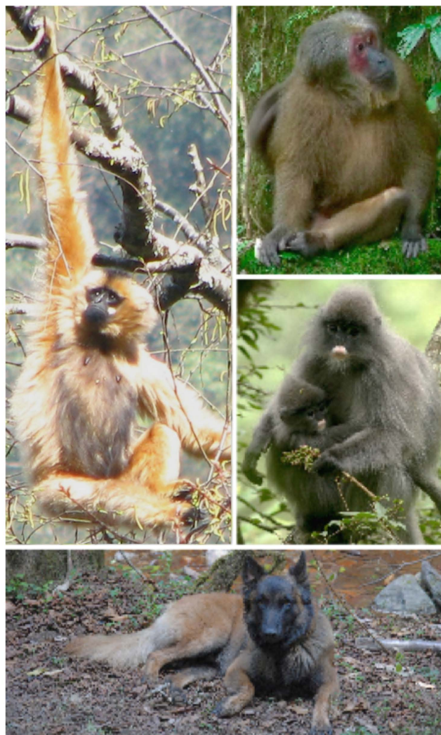
Figure 1. Clockwise from top left: western black crested gibbon ( Nomascus concolor ), stump-tailed macaque ( Macaca arctoides ), Indochinese gray langur ( Trachypithecus crepusculus ), and Pinkerton, the scat-detection dog.