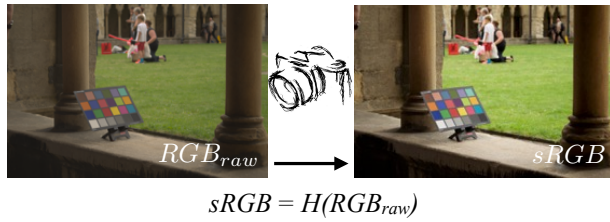
Figure 2: Color correction (mapping raw to display sRGB) is an homography problem. This figure is also a color chart example which was used for our color correction evaluation.

maps colors in RGI form between illuminants. Due to different shading, the RGI triple under a second light is represented as \underline{c}' = \alpha' \underline{c} H , where \alpha' denotes the unknown scaling. Without loss of generality let us interpret \underline{c} as a homogeneous coordinate i.e. assume its third component is 1. Then, [r' \ g'] = H([r \ g]) (chromaticity coordinates are a homography H() apart). \square