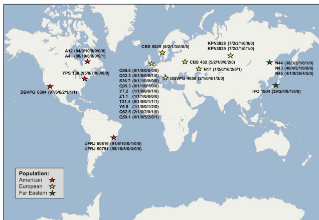
Figure 1. Geographical Location of the S. paradoxus Strain Collection. World map with the location of the collection sites for the S. paradoxus strains indicated by stars. Stars are coloured by population type. In brackets following each strain are the numbers of SNPs, insertions, deletions, pSNPs, partial insertions, partial deletions and complex mutations identified for that strain in this study. World map template downloaded and modified from https://commons.wikimedia.org/wiki/File:World_map_blank_shorelines_semiwikimapia.svg .