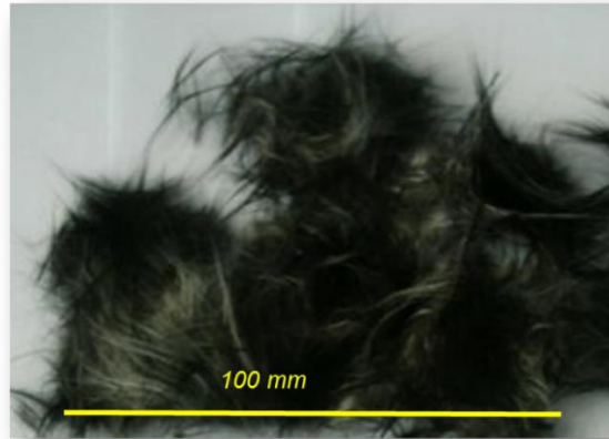
Figure 5. Recycled carbon fibres (fluidised bed).

The recycled carbon fibres are in a fluffy form comprising individual fibre filaments (Figure 5). The fibres are clean and show very little surface contamination. Carbon fibres show a lower strength degradation (< 20 %) with retention of the original stiffness. Fibres do not show any measurable oxidation.