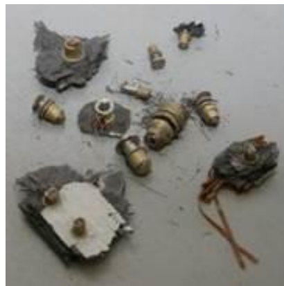
Figure 2. Contaminated composite scrap.

An additional benefit is that the fluidised bed has a very high tolerance for waste contamination [17]. The manufacturing scrap has a lot of rivets, bolts and other fittings occasionally found within pieces of scrap (see Figure 2). The fluidised bed will simply collect these fittings in the bed, while the composite around them is recycled. Of course if too much contamination of this nature builds up, fluidisation quality will be affected. Fibres typically show a 20% reduction in tensile strength, and roughly 10% drop in stiffness [4].