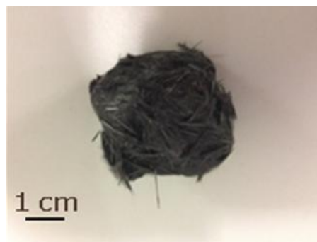
Figure 4. A series of agglomerated recovered from a fluidised bed

Previous work in the group has also shown how important process temperature is on residence time and fibre property retention [19, 20]. However Jiamjiroch (2012) has demonstrated that agglomerates can form inside a fluidised bed (Figure 4) [20]. It is currently unclear exactly how these agglomerates form, and what state the fibres that form them are in (i.e. free fibres, or bundles with partially degraded resin). Agglomerates have been an area of interest since they were observed in a fluidised bed. So it follows the key to high throughput in a fluidised bed is the intricate understanding of how fluidisation affects, and is affected by feed distribution in the bed, and the process temperature that provides the most efficient rate of fibre elutriation.