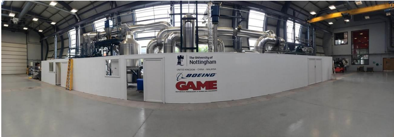
Figure 3. Fluidised bed at pilot scale located at the University of Nottingham.

specific mass of feed. Preparation of material is an area tightly linked into the market for the final product. For example if the final product requires fibres of a specific length range, this can be addressed by a shredding process specific to generating composite feed of relative size.