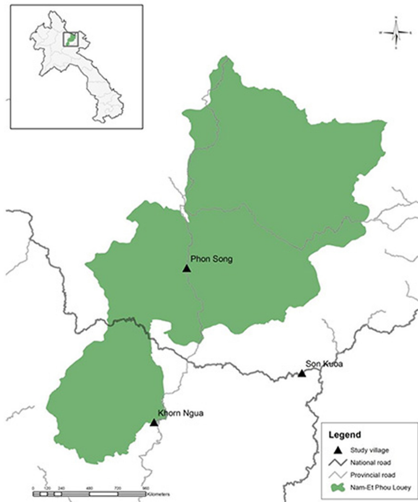
Fig. 1. Location of the three study villages in Laos, the Nam-Et Phou Louey National Protected Area, and roads.

Although a complete literature review of whether scholars adopt a multi-method approach is beyond the scope of this paper, it is evident from the reviewed studies that the repeated calls for combined methods not have been heeded in studies of people's use of wild food, fodder, and medicinal plants. Rather, there is a methodological bias toward surveys based on respondents' recall. The review thereby illustrates the timely need to encourage and improve future applications of multi-method approaches. In the following sections, we demonstrate how such research can be carried out in the shifting cultivation systems of Southeast Asia.