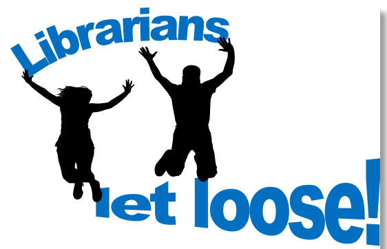
Fig. 1 Logo used to brand the UEA roving programme

Looking at the work Huddersfield had done on their roving librarian concept 4 we realised we needed a visual brand for our programme to make it clear and memorable to students and to catch their attention. 'Librarians Let Loose!' was born from the desire to keep the word librarian (as we felt this indicated who were most clearly) but also inject a sense of fun and emphasise the fact that the library service was not confined to just one building.