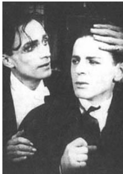
Fig. 1.4: Veidt (left) as he looks in Anders als die Andern .