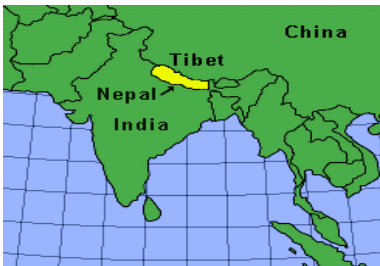
Fig 1. Map showing position of Nepal in Asia