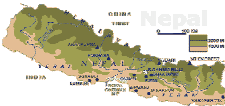
Fig 2. Map of Nepal showing the position of the Mountains, Mid-hills and Terai

The following is a summary of information about forestry sector and practices in three major zones of Nepal: the highlands or mountains; the Mid-hills; and the Terai. As there is a wealth of information about community forestry in the Mid-hills of Nepal, the focus of this profile will be on the Terai, which has often been neglected but possesses high-value potential for a sustainable forestry sector if managed effectively.