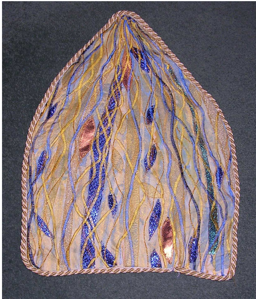
6 'Light Flows' by the author