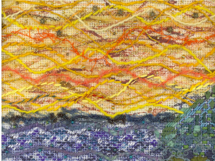
2 'Be Still and Know' – Tapestry by the author

can the full design and beauty of the tapestry be seen. (Conaway, Undated, p 11)