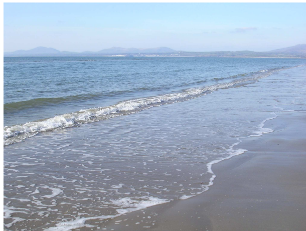
8 'Harlech Beach' by the author

It is warm for the time of year. I reach the beach having walked through the sand dunes. The sand is wet and firm. I take off my shoes and socks, and, for the first time in years, I feel the sand beneath my feet. It is cold and hard as I walk out to the water's edge. I stand at the edge of the sea where the