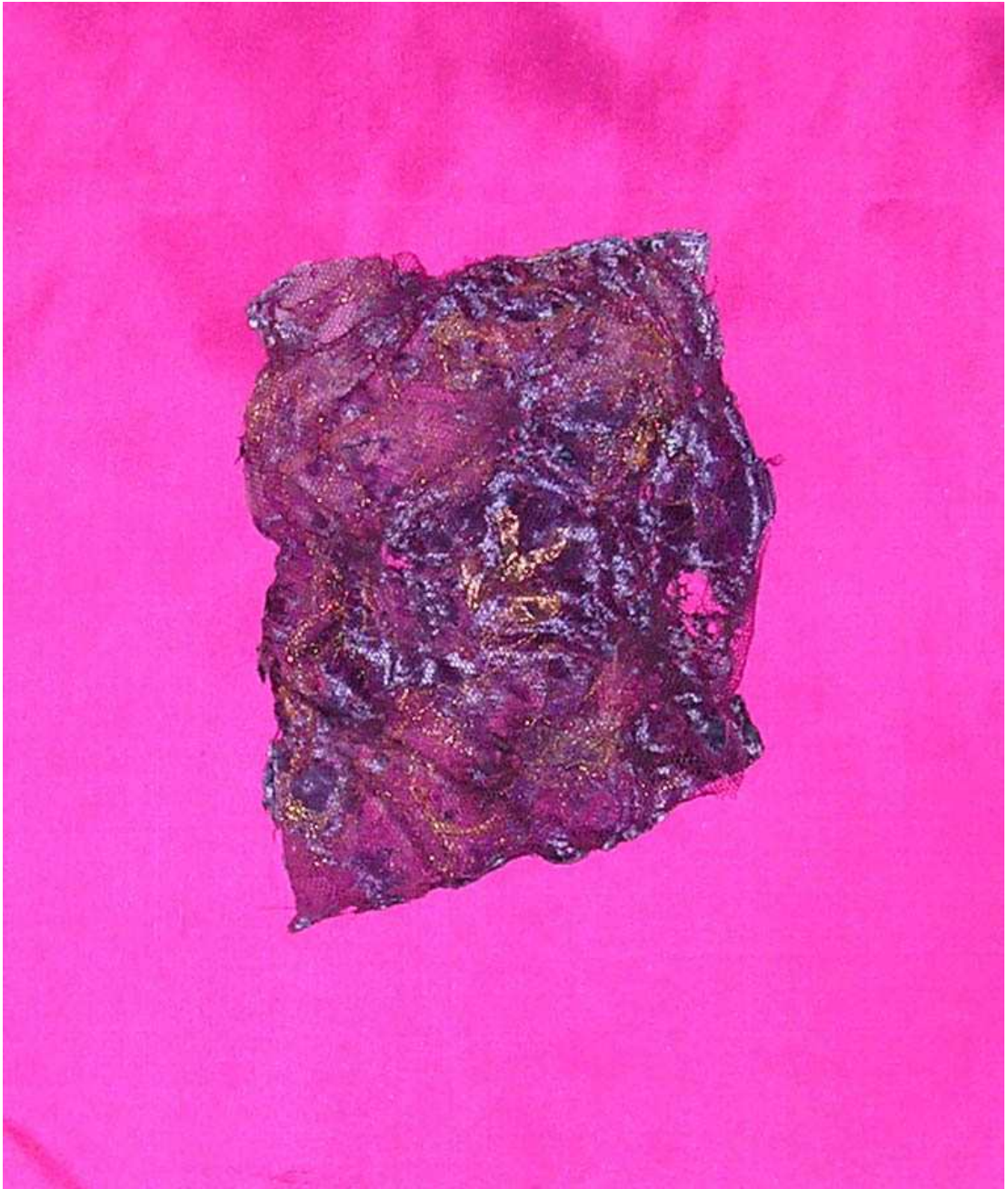
7 'Ash Wednesday' by the author