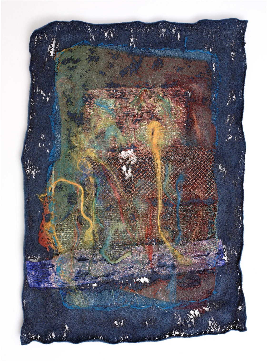
4 'Boundaries and Beyond' by the author