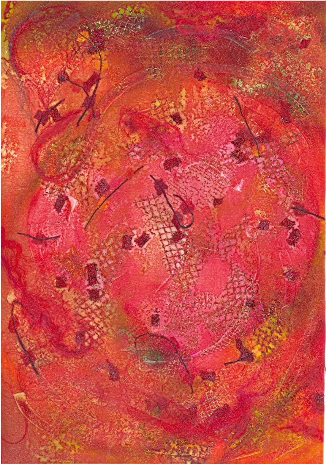
5 'Eucharist' by the author