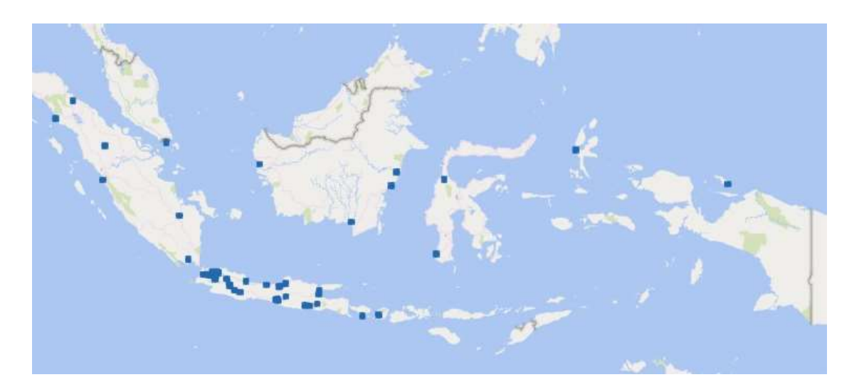
Figure 2: Areas where online responses originated from, according to their geoIP

As MPP is a shared problem, all actors of a society are expected to act in support of its mitigation. Accounting for those that were not willing to support MPP mitigation options was imperative. Genuine zero bidders were retained and protesters were removed from the analysis, since the latter responses' truthfulness and validity is questionable (McFadden and Train, 2017). Protestors were identified as those who stated "No" in the WTP question and offered one of the following reasons for doing so: "There are enough things I pay money for, I have no interest/use of paying extra money", "Cleaning the environment is the responsibility of local authorities and they should pay for it, not me" and "I am not interested in paying anything about the natural environment". Most the respondents were willing to pay for the new MPP management service (16% of the sample was against this scenario and the main reasons were: not having enough to pay, they pay enough already and that it is the government's job to pay for MPP reduction were the prevailing responses). The quality of responses was also assessed by identifying "speeders" (those taking have the median time to complete the survey) and those taking more than the 4-times the sample's median time to go through the survey as well as if their geo-IP came from another country. This resulted in 751 valid responses being retained for analysis. Respondents from 33 Indonesian provinces are captured in this analysis (Figure 2).