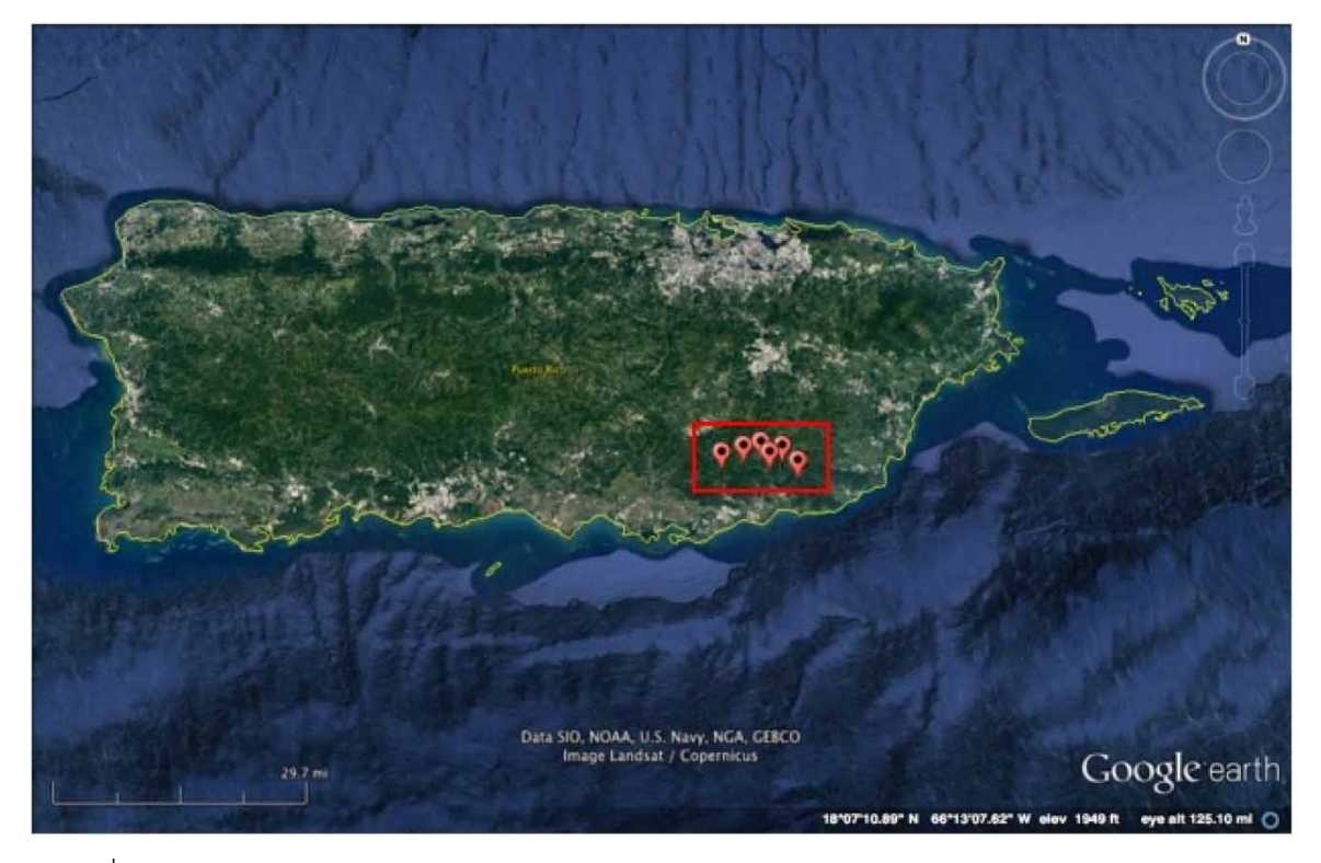
Figure 1 | Study site locations in the southeast of the island of Puerto Rico.

The highest and the three lowest presumptive TC aliquots were confirmed following Standard Methods (APHA 2005; Minnigh et al. 2006). Complete phase was done simultaneously in EC broth (Difco) and in 4-methylumbelliferyl- \beta -D-glucuronide (MUG) (Difco) to detect Thermotolerant Coliforms and E. coli , respectively. E. coli (ATCC 25922) and E. coli O157:H7 from the Department of Health of