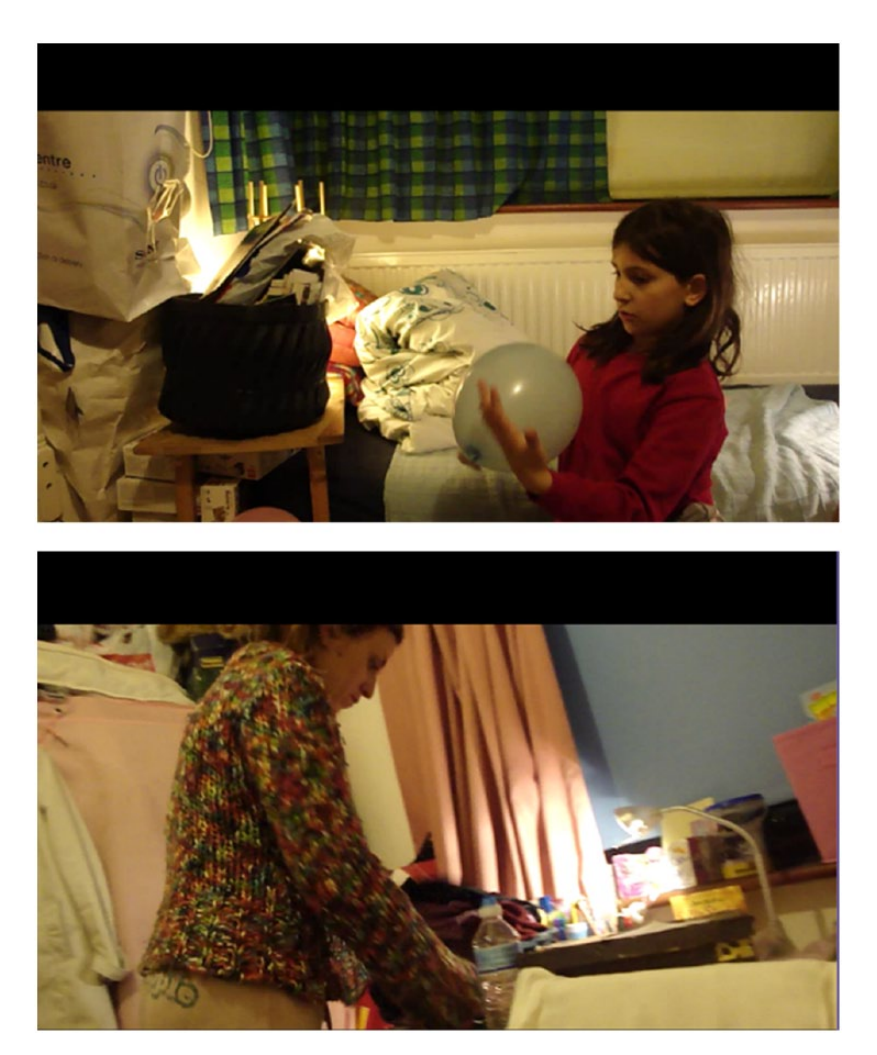
Figure 1. Examples of video stimuli: Still frames.

happened after each video clip (verbalisation stage). After watching the videos (which were randomised across the participants in order to avoid recency effects) and verbalising what was seen, a distractor task of 120 seconds in the form of a 10 \times 10 grid of randomised letters was shown on the screen, and the participants were asked to count how many letters M, N and Z they could see.