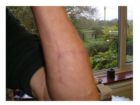
Figure 3 Photographs taken by Richard of his of 'claw' deformity associated with an ulnar nerve disorder and his scars, representing the impact of the disorder on body image

All participants struggled with bilateral activities e.g. cutting food using a knife and fork together, as here participants were forced to use their affected hand and it was more difficult to compensate. For those participants that injured their dominant hand the process of learning to change handedness either temporarily or permanently was stressful. This impacted on their ability to return work, with half of the participants experiencing a change to their occupational status. Those with fast paced or manual jobs were particularly affected. This had a significant impact upon occupational identity and participants expressed that receiving more assistance to learn how to change handedness would have been helpful.