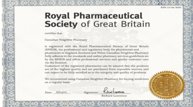
Fig. 2 Certificates displayed on certain websites when clicking on their 'regulatory' logos

scrutiny. It also found that unsuitably large quantities of medicines (including POMs) can be ordered online with unverified patient questionnaires representing no obstacle to access. This concurs with the findings of Gallagher et al. [11], who investigated online sales of sildenafil; they too were unable to verify whether online questionnaires were scrutinised by healthcare professionals.