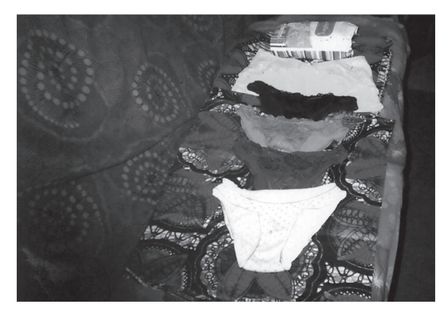
Figure 16.1 "Gifts from my mother: underwear, chitenges and disposable pads."

The first period is an important event in the life of girls in peri-urban Lusaka. All participants narrated how, although they were afraid or scared when they saw blood in their underpants, they were also overwhelmed with gifts, blessings and teachings (see Figure 16.3). Upon seeing their first period, girls are taught new practices to live with their periods. After these lessons, girls are celebrated for achieving a milestone in their lives and are ready to face the world as " matured and knowledgeable women ." During the week of their