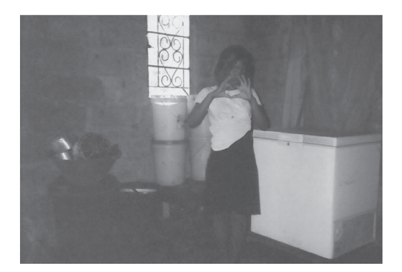
Figure 16.5 "I want to have someone on my side to protect me and comfort me when I am in trouble and provide for me, maybe help me pay for school."