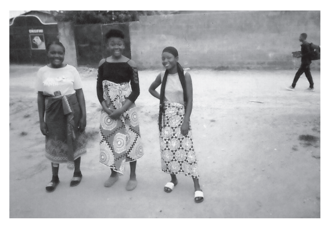
Figure 16.2 "Our new chitenges."