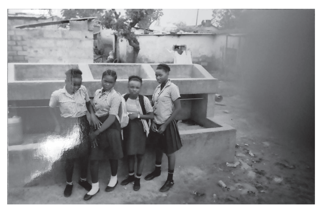
Figure 16.9 "Today there is no water in the compound."