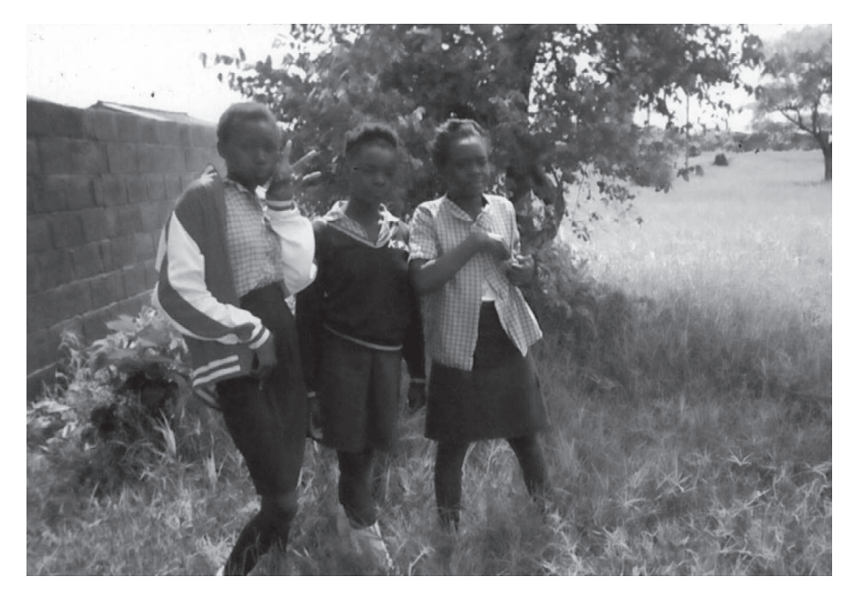
Figure 16.7 "When I arrive to school I forget about the pain because I am with my friends."