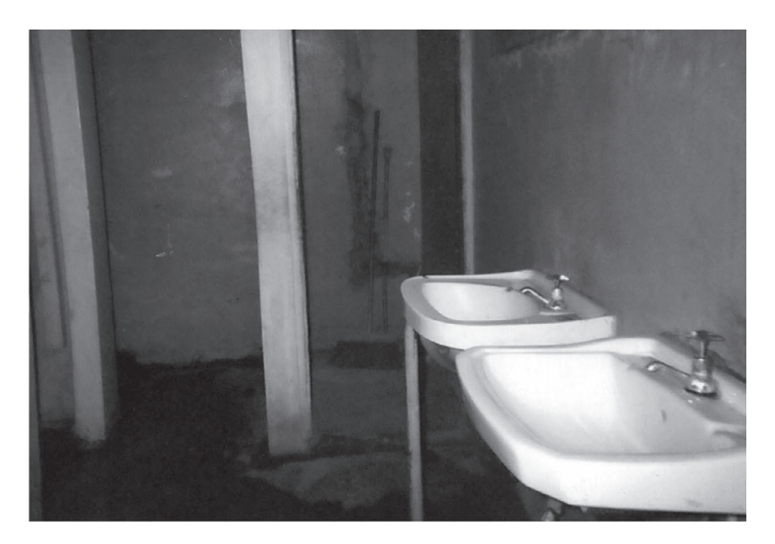
Figure 16.8 "The toilets are broken and there is no water. . . . Since grade fourth (four years ago) this shower has been broken."