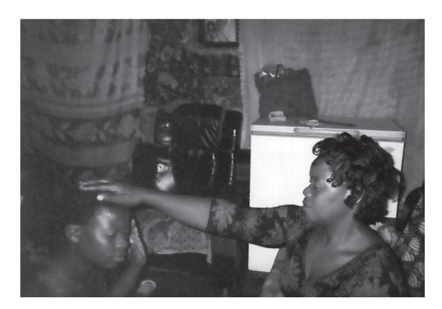
Figure 16.3 "I enjoyed the day, I love the way my mother talked to me, and she blessed and prayed for me."