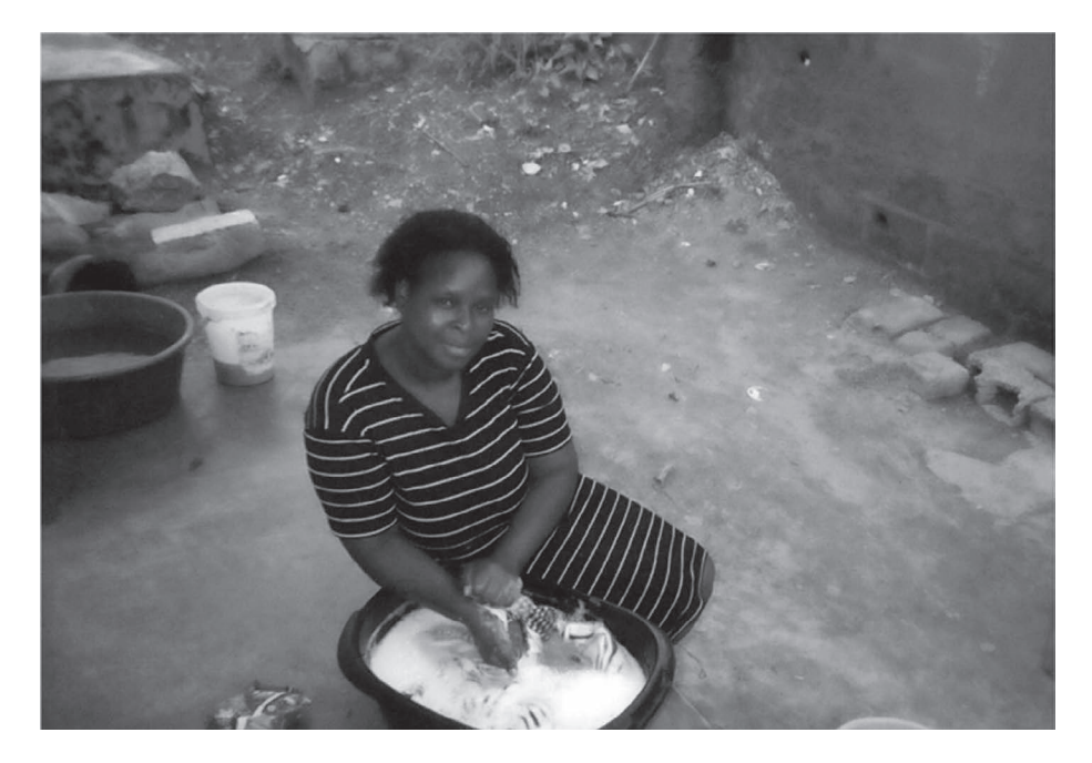
Figure 16.11 "When I am menstruating my mother does the home chores for me to rest and recover from my period."

The fifth theme which came up in photovoice workshops has to do with modesty . Young girls are discouraged from talking about their periods with boys and men. During an NGO activity to distribute reusable pads in one of the schools, the girls were told to hide the reusable pads before leaving the class, and not to display them around school. Most adolescent girls are also expected to follow certain standards in what concerns modesty: chitenges cloth pads, underpants and underwear are not to be hung outside for drying, these items should be air dried inside the home or hidden from boys and men. Special places or bags are provided by mothers for their daughters to keep their menstrual products safe and out of sight. Some girls who wear disposable pads explain that their mothers help them with money to buy the pads (or buy the pads for them). They argue that they prefer disposable pads due to the lack of good water services to wash chitenges , and they prefer burning