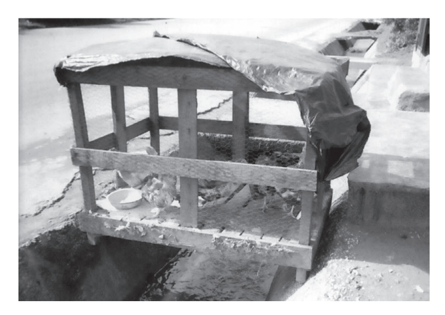
Figure 16.4 "We ate chicken with rice."

It is common among girls reaching menarche to undergo a traditional initiation ceremony, commonly called Moye in the local language. Traditionally during Moye , girls were confined indoors for between one to three months, after which a ceremony was organised for them. During this month they were taught how to cook, respect their in-laws and look after their husbands. They are also told how to shave their pubic hair and to sexually satisfy their husbands, with different sex positions showcased through dance moves. People brought gifts (money, cloth and chickens) and in most cases after a few months of the Moye celebration, the girl was promised in marriage. The initiation processes of Moye depends largely on the ethnic group to which a family belongs.<sup>7</sup> In the context of Lusaka's compounds however, only some families still practice it, as many within the community have converted to Christianity and do not observe traditional rituals. The girls whose families do practice Moye explained that initiation rituals have transformed deeply with time. They now spend only one week home after their first period and a party with food and music is organised after the seventh day. Community