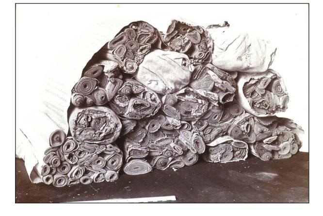
Figure 9 Several regular bundles in their hemp covers, one with an inscription. British Library, Photo 392/27(589).

Turning to his final classification, B4, the regular bundles, were many of these, as Rong has argued, 'Buddhist sutras stored in traditional bundles.'? (2013: 113) Rong based this conclusion partly on a photograph taken by Stein in 1907 and reproduced below, which shows a pile of bundles still in their hemp covers. An inscription on one of the bundles is clearly visible. It reads: 'Mohe bore 摩訶般渃一海.' Rong writes: 'This is