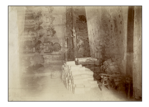
Figure 3 The double exposed image showing some of the bundles of manuscripts in the corridor of Cave 16. Stein 1907. The British Library, Photo 392/59(2).<sup>37</sup>

As noted above, Stein spent from 23–27 May examining these miscellaneous bundles, interested in anything dated and in languages and scripts other than Chinese. On 28 May, Wang Yuanlu removed the remaining regular bundles of Chinese and Tibetan manuscripts from the cave and placed them in the corridor of Cave 16 where they were photographed by Stein (Figure 3), although this negative was double-exposed.<sup>36</sup> Stein also counted