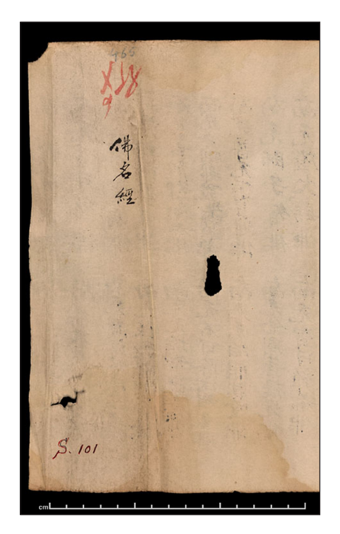
Figure 4 Detail of the verso of manuscript Or.8210/S.101 showing the mazi number in red and title in black added by Jiang and the corresponding Arabic number in blue pencil added on unpacking or later.

Figure 3 The double exposed image showing some of the bundles of manuscripts in the corridor of Cave 16.<sup>37</sup>