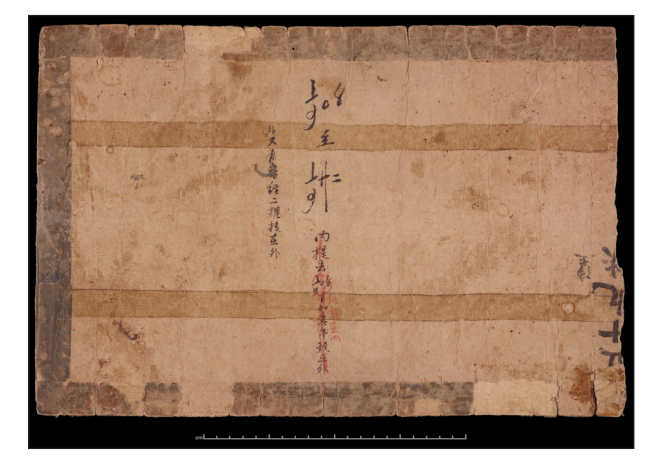
Figure 8 Paper scroll wrapper from Dunhuang, Or.8210/S.11049 with annotations by Jiang Xiaowen.

This suggests that we would therefore be able to retrieve some bundle information as contiguous numbers would, in many cases, belong to the same bundle. It is difficult to test this further until all the mazi numbers are recorded, but we can say that this sequence may provide some useful information.