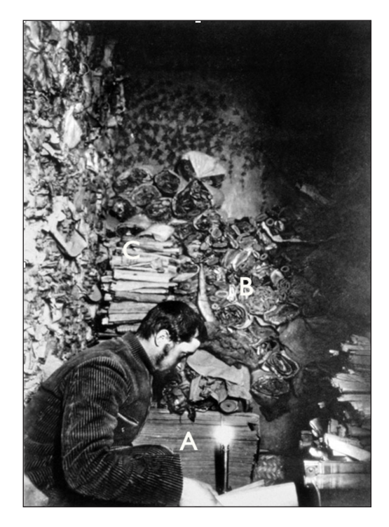
Figure 1 Paul Pelliot examining manuscripts inside the library cave in 1908. Photograph: Charles Nouette. Musée Guimet AP8187, with annotation by authors.

On the second question, which is key to our argument here, Stein describes 'regular bundles' wrapped in hemp covers, which were mostly sewn up, and considers whether these covers were original or added by Wang (1912: 190).<sup>13</sup> He notes that Wang asserted the former. Several of Stein's photographs shows piles of bundles (Photo 392/27(587–9) and see Figure 9), sewn but 'the ends are generally left open.' (1912: 190; 1921: 823). The wrappers shown in these photographs appear to be no more than pieces of cloth with little shaping while other scrolls have no outer wrapper.