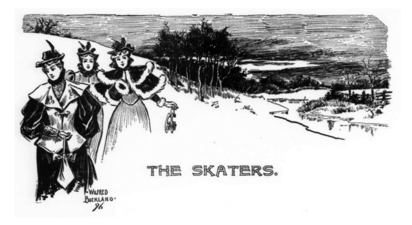
Figure 4. 'Life felt buoyant, strong and sweet!' (Rogers 1897).

gadgets, specialist clothing, camp food, and remedies. Essentially, they described the great outdoors as a place for spiritual, physical, and moral renewal to be achieved through the leisure pursuits of the consumer economy. And they packed Christmas into that framework.