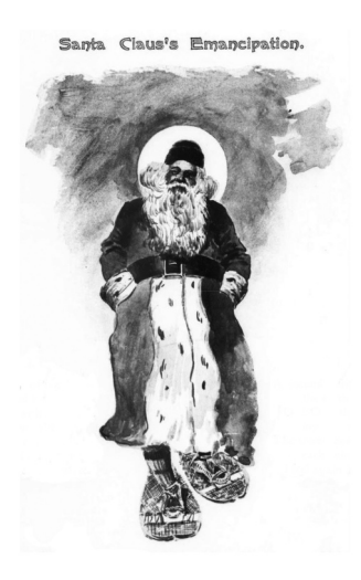
Figure 2. Snowshoes: the perfect gift for Santa Claus? (Turner 1897).

Figure 1. F. Childe Hassam, 'A Midwinter Reverie'. From The Wheelman (Hassan 1883).