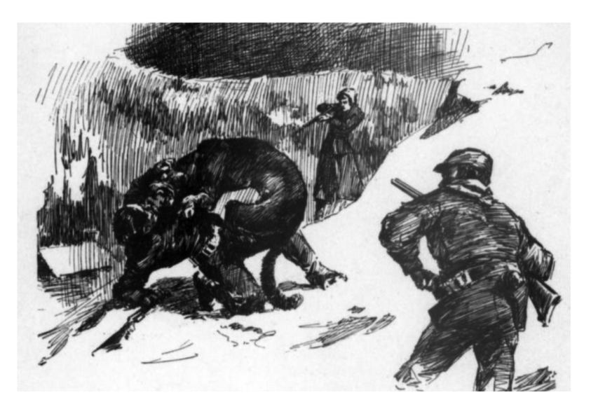
Figure 6. 'It seemed but an instant until Hank was down with a great form towering over him'. (Wolfe 1893).

Figure 5. 'Christmas skedaddlers' on a difficult festive ascent of Mount Adams. (Corbin 1892).