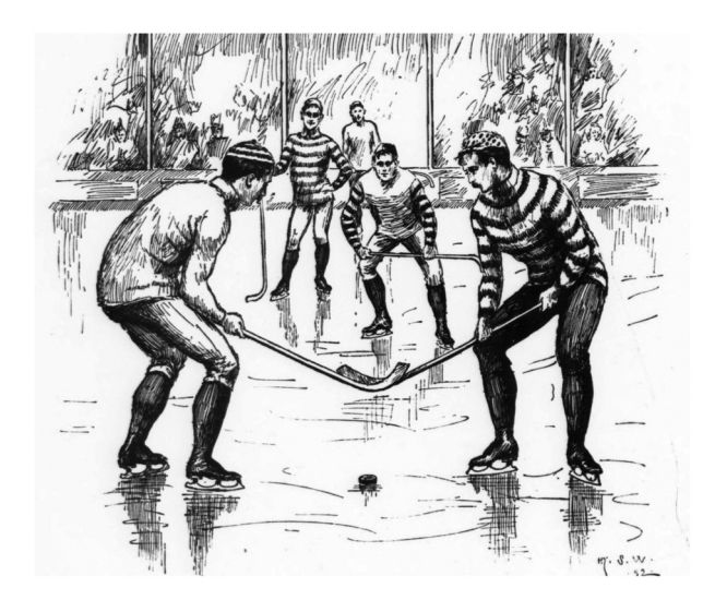
Figure 3. Winter sports at Christmastime. (Bogert 1893).