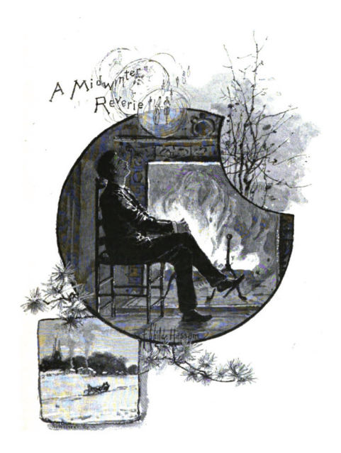
Figure 1. F. Childe Hassam, 'A Midwinter Reverie'. From The Wheelman (Hassan 1883).