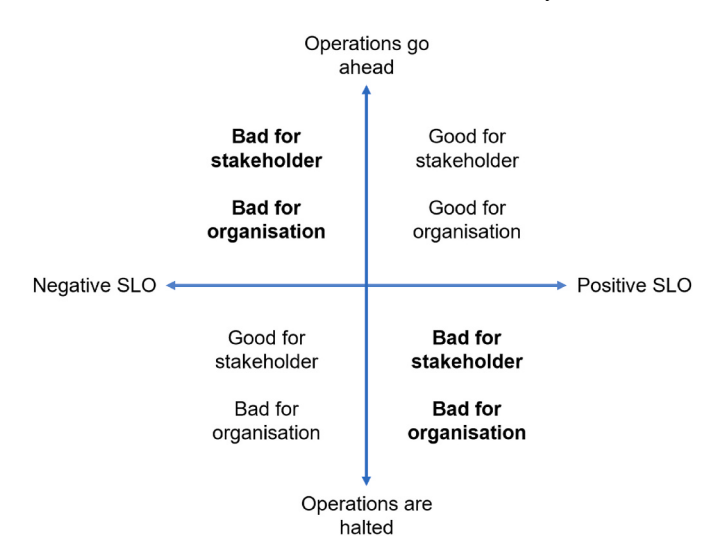
Fig. 2. The four potential SLO outcomes, adapted from Prno and Slocombe (2014). SLO outcomes have two dimensions, whether SLO was granted (x-axis) and whether operations go ahead/continue (y-axis), each quadrant represents one of the four outcomes, with the text inside showing its relevance to the community and organisation. Quadrants in which the SLO judgements and operational outcomes are uncoupled have been highlighted with bold text.

This paper provides an explanatory model for how individual stakeholders come to SLO judgements and how these may impact the operations of a project or organisation, building upon existing component-based (e.g. Moffat and Zhang, 2014) and process-based (e.g. Boutilier, 2020) conceptualisations of SLO. In doing so, it highlights how stakeholders can impact operations, and the importance of supporting marginalised stakeholders such that they are able to express their judgements and practice their right to self-determination. The model is not intended to quantify how SLO might be achieved through facilitating proportional allocation of the various elements included. Rather, it is designed to highlight the complexity associated with gaining SLO and to highlight the myriad of factors that organisations need to consider. It is anticipated that the importance of different elements will be context dependent meaning learning from a variety of disparate cases will be required to determine whether there are co-dependencies between factors that will assist organisations planning for the SLO. Once this has been achieved, this model will provide a means by which organisations can consider how their actions may impact SLO judgement formation, thus allowing for better project planning and outcomes.