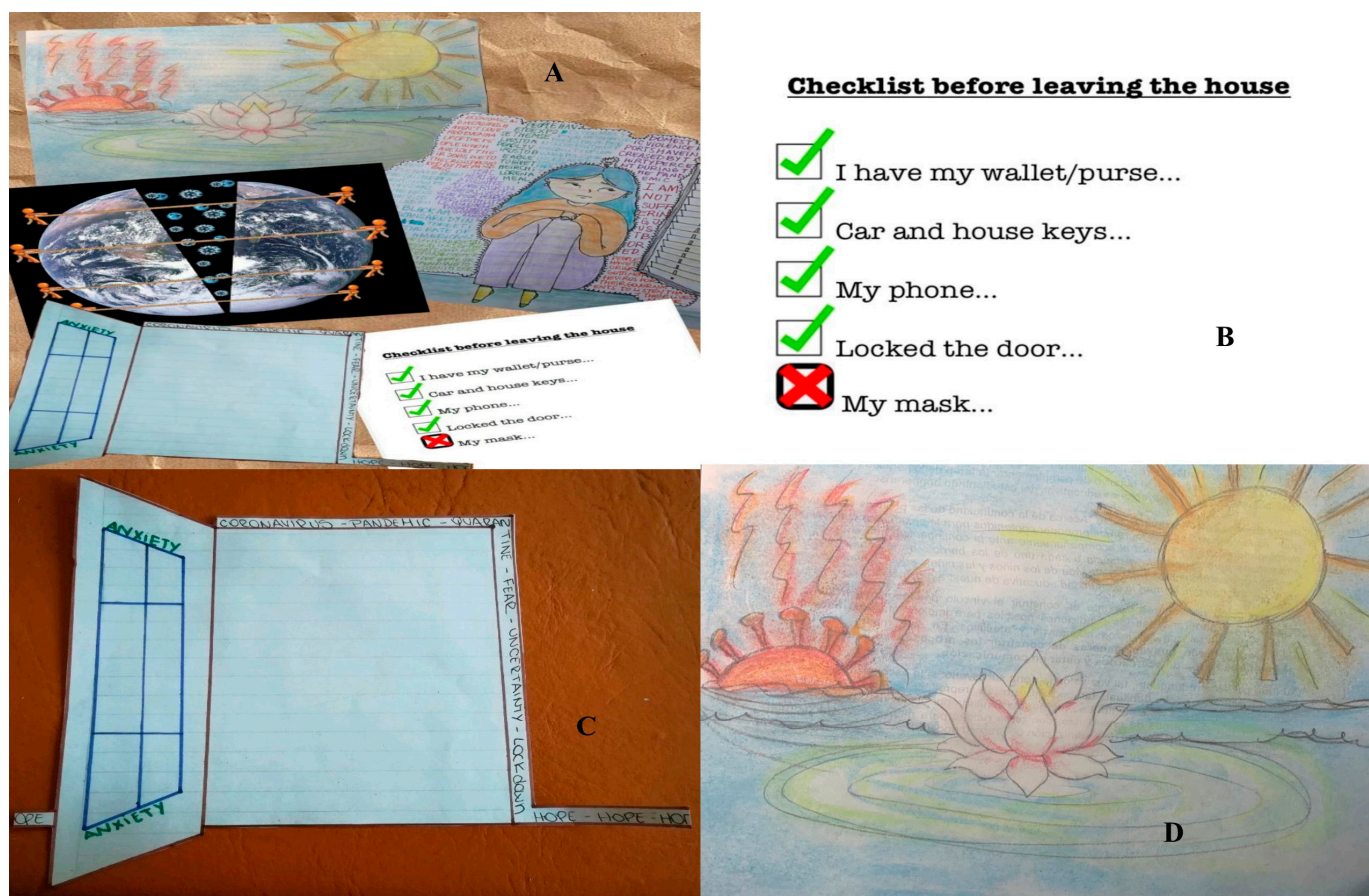
Figure 3. Emotional engagement through artistic work for transformation.

Door: ‘I tried to use a very ordinary object to communicate what I think the pandemic has affected our old lifestyle. The COVID-19 forced us to be indoors. Three months of social isolation have gone, and we are not sure when we will be able to leave our houses and remake our lives ( . . . ) In the frames of this door, which I metaphorically associated with the things that surround us, I included the negative feelings that are the ones that surface the most . When going down in the frame, what emerges is “ HOPE ”. This positive feeling that we all have, as we all want this pandemic to come to an end, is surpassed by the negative emotions. The window is the place from where we look to the outside; that place that seems to be very far away from our isolation perspective . Whenever we are ready to cross that door, we will for sure, need to be very much responsible (emphasis added)’.