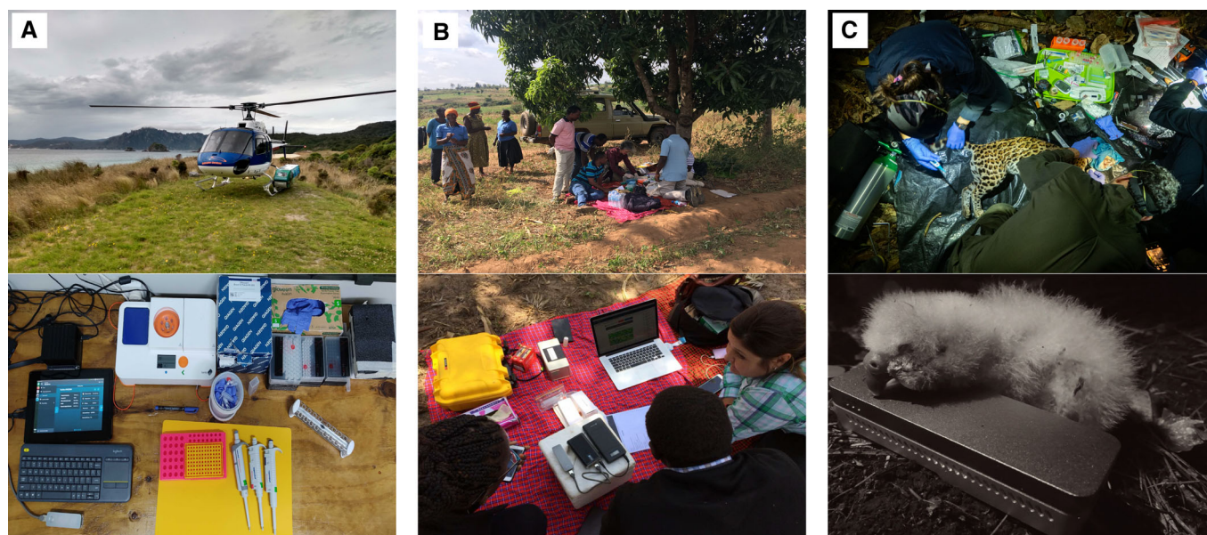
Figure 3. Applications of real-time genomics for One Health at the point-of-care.

(A) In situ applications on remote islands in Aotearoa New Zealand through the employment of portable laboratory, sequencing, and computational equipment. (B) Food security application and community involvement on subsistence farms in Tanzania to rapidly diagnose African cassava mosaic viruses in cassava plants. (C) Biodiversity monitoring applications for the conservation of critically endangered wildlife in Ecuador ( top ) and Aotearoa New Zealand ( bottom ).